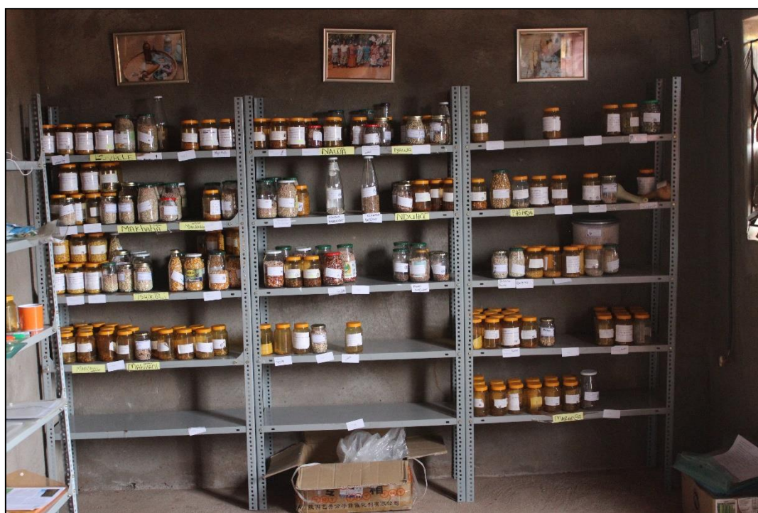
Photo 1. The Gumbu community seed bank seed collection in 2016.

about use, cultural values, and agronomic traits of the crops and crop varieties found in the community. The register includes information about the community members who register the seeds, such as name, sex, age, and years of residence in the community. It is worth noting that the register for Sterkspruit has entries in English and Xhosa, whereas the one for Gumbu has entries in English and Venda. As of December 2016, the Gumbu community seed bank had registered 126 accessions (Photo 1). Most likely these are not all unique accessions given that farmers who donated seeds to the community seed bank might be growing the same variety. Some farmers in Gumbu do not distinguish varieties by name, e.g. they name all yellow-coloured maize “yellow maize”. A more in-depth analysis would be required to find out the exact number of unique accession.