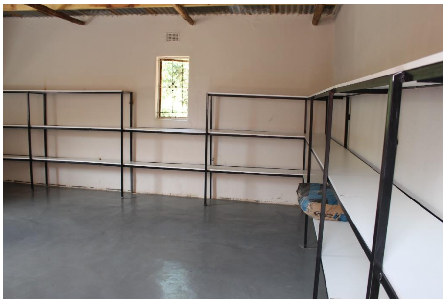
Photo 12: The renovated facility for the Jericho community seed bank.

Following a meeting held between DAFF, READ, the Traditional Authorities and Jericho farmers on the 27 July 2017, the elected committee members of the Jericho farmers, together with READ and DAFF officials, visited and inspected two proposed sites/ buildings that could be used as a seed storage facility. The farmers identified a building with two rooms, that was initially used as a crèche, as suitable for hosting a community seed bank. The building needed to be renovated by painting the walls, replacing broken windows, adjusting the roofing and replacing the broken doors. The traditional authority representative indicated that the farmers could use the building, but the challenge is water scarcity in the area. Renovation work started in the second part of 2017 and inauguration of the renewed facility is expected to take place in the spring of 2018 (Photo 12).