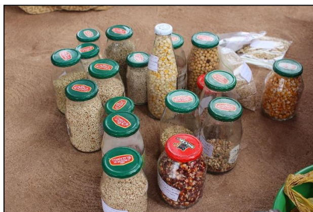
Photo 6: New seeds for the Gumbu community seed bank (September 2017).

They are also very clear about what they expect from the community seed banking efforts.