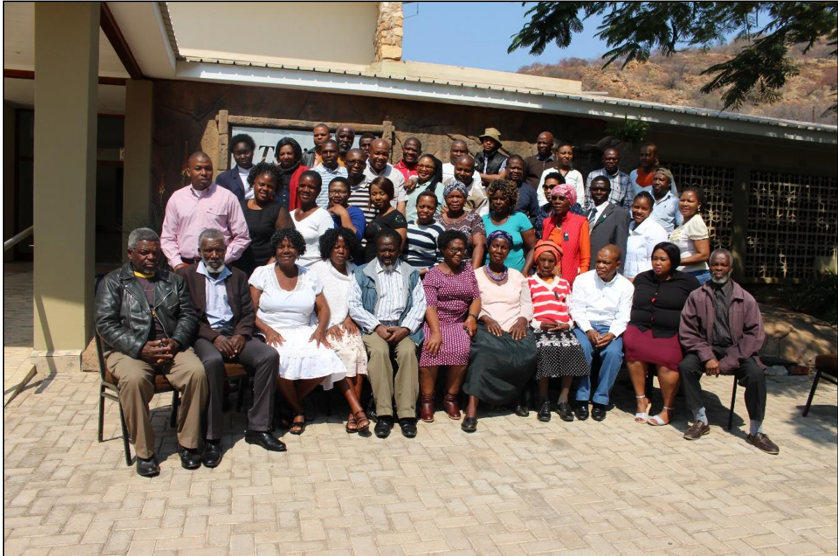
Photo 11: Participants of the workshop at the Tshipise Forever resort.

During the workshop the outcome of the above exercises was presented, indicating how the diversity in both Provinces is being lost at a high rate and recommending that precautionary measures need to be taken. The establishment of the community seed banks in Gumbu and Sterkspruit was based on the findings of the situational analysis. In terms of varietal diversity, it was found that in Gumbu there were 168 varieties and 114 in Sterkspruit before the community seed banks were established.