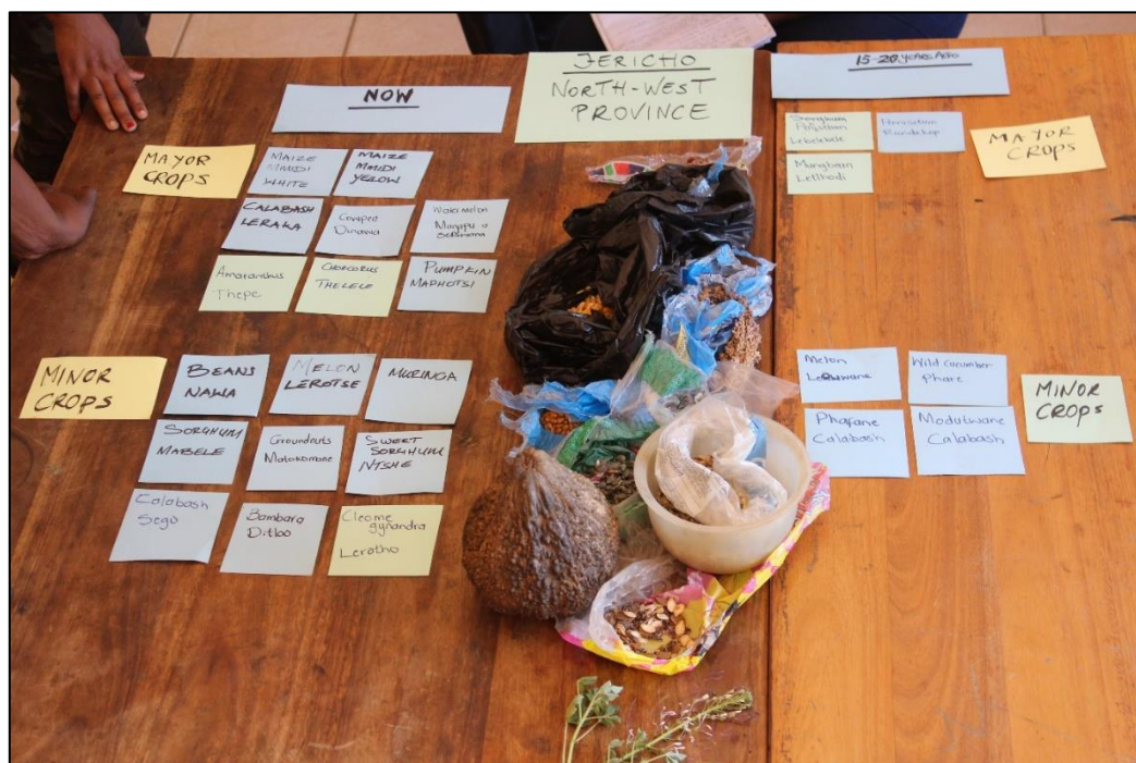
Photo 13: Historical crop trend analysis carried out with the community in Jericho, North West Province.