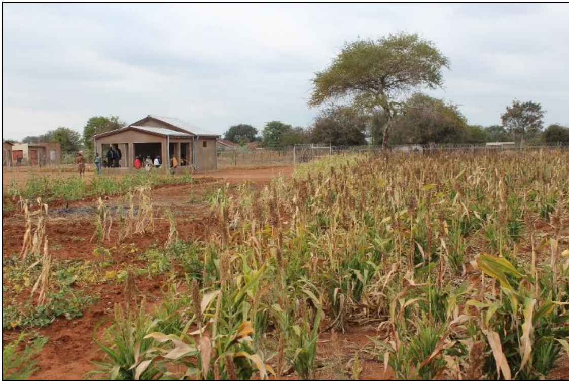
Photo 2: Seed multiplication plot in Gumbu.

In 2017, farmers in the Eastern Cape could not harvest enough seeds from the regeneration plots due to lack of rains and due to irregular monitoring given the distance from their respective villages to the town of Sterkspruit where the community seed bank is located. Based on this experience the farmers decided to adopt a new strategy whereby they multiply priority crop varieties stored in the community seed bank on their own farms. This makes regular monitoring much easier. After the harvest, the farmers bring new quantities of seeds to the community seed bank for storage and possibly, exchange. This new strategy includes sowing, weeding, harvesting, cleaning and storage of seeds. Selected crops included Bambara nut, cowpea, maize, pumpkin, sorghum, watermelon and wheat. In addition to the existing inventory of 2016, the farmers brought 17 more accessions to the community seed bank. The Sterkspruit community seed bank has a large number of maize varieties which underscores the high importance of the crop; more than any other crop. One of the community seed bank farmers maintains a wealth of maize diversity on his farm, which he backs up in the community seed bank. The new 2017 accessions donated to the community seed bank are indicated in Table 1.