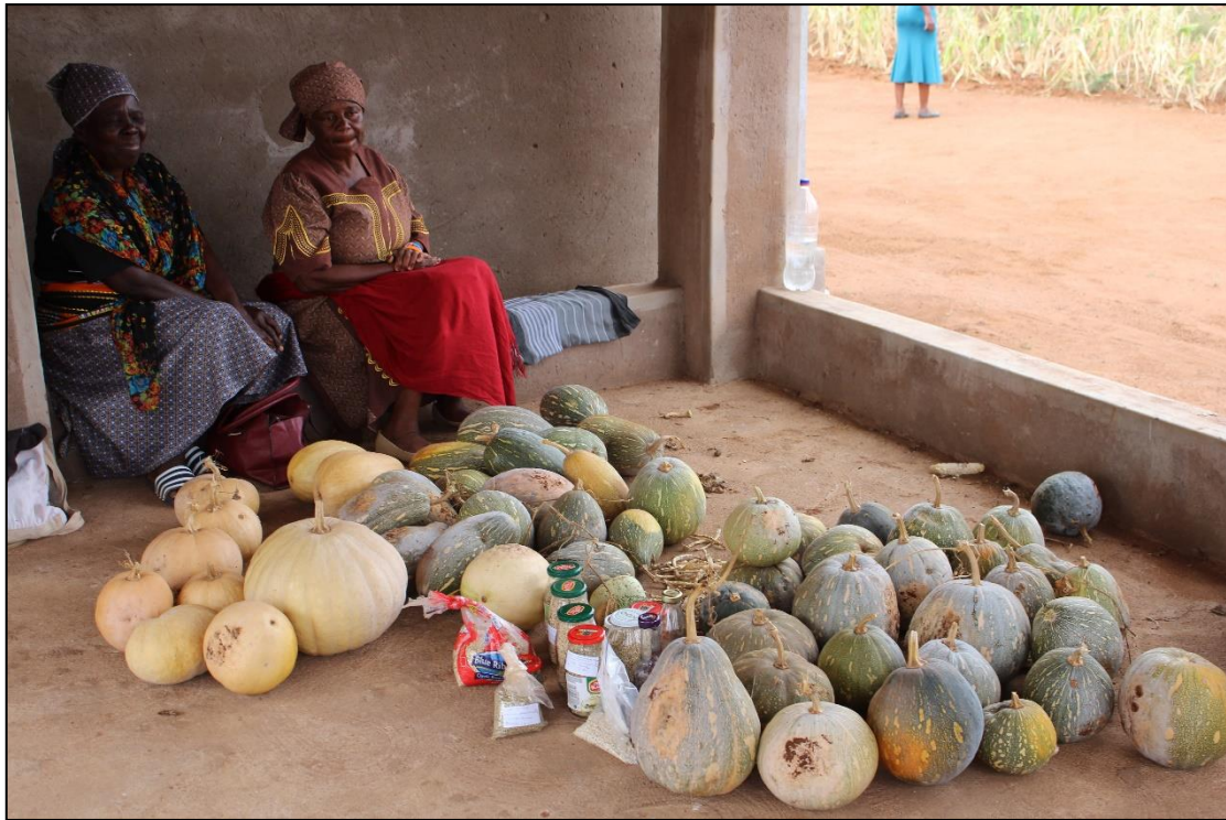
Photo 4: New seeds for the Gumbu community seed bank.