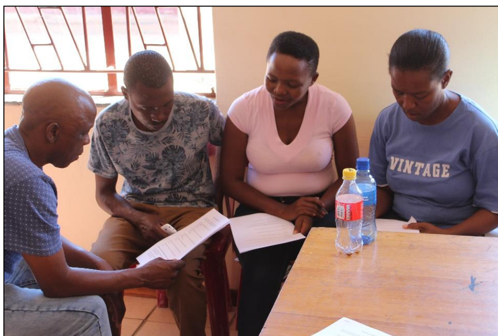
Photo 16: Answering the farmer questionnaire, Jericho.