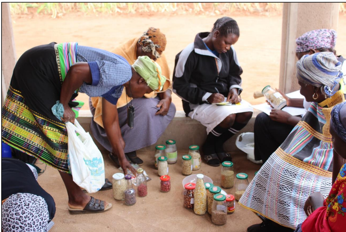
Photo 5: Gumbu community seed bank members register new accessions.