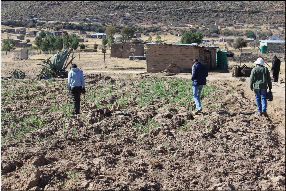
Photo 8: Seed multiplication on the farm of one of the community seed bank members, Sterkspruit.