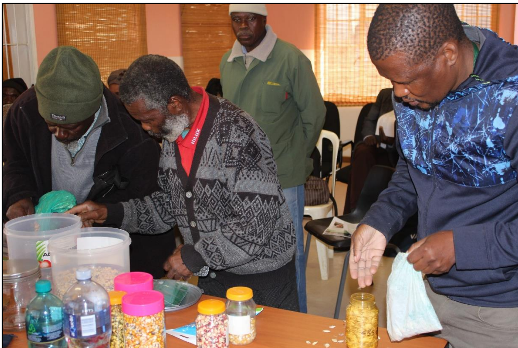
Photo 7: New seeds for the Sterkspruit community seed bank (September 2017).

Farmers are very clear about their expectations, which include continuing the conservation efforts, starting to work on improving access and availability of seeds, and strengthening communications and awareness raising.