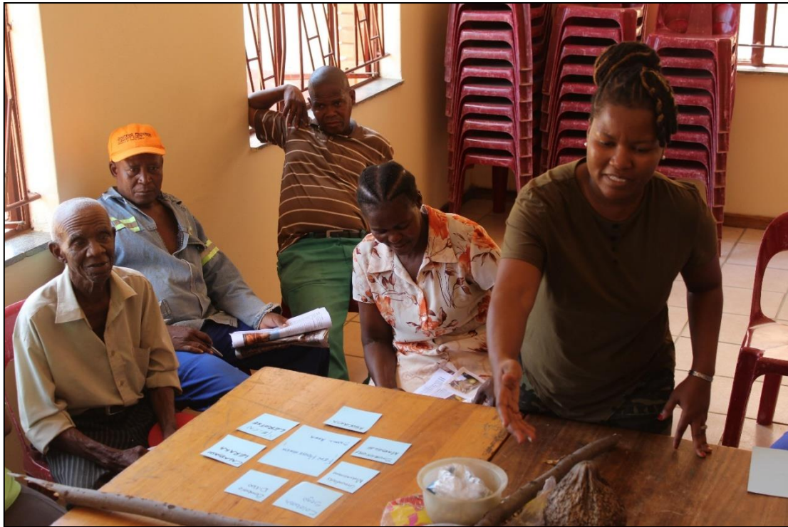
Photo 14: Doing the 4 cell analysis exercise with the community participants in Jericho, North West Province.

The exercise revealed that seven seven crops, ranging from yellow maize, Jugo beans, calabash, groundnuts, melon, Corchorus spp and Moringa are being planted by few households in Jericho; the first six on a small area of land. This usually implies that these seven crops are the ones under threat from biodiversity loss. This was discussed with the farmers highlighting the key role of the community seed banks to conserve these crops.