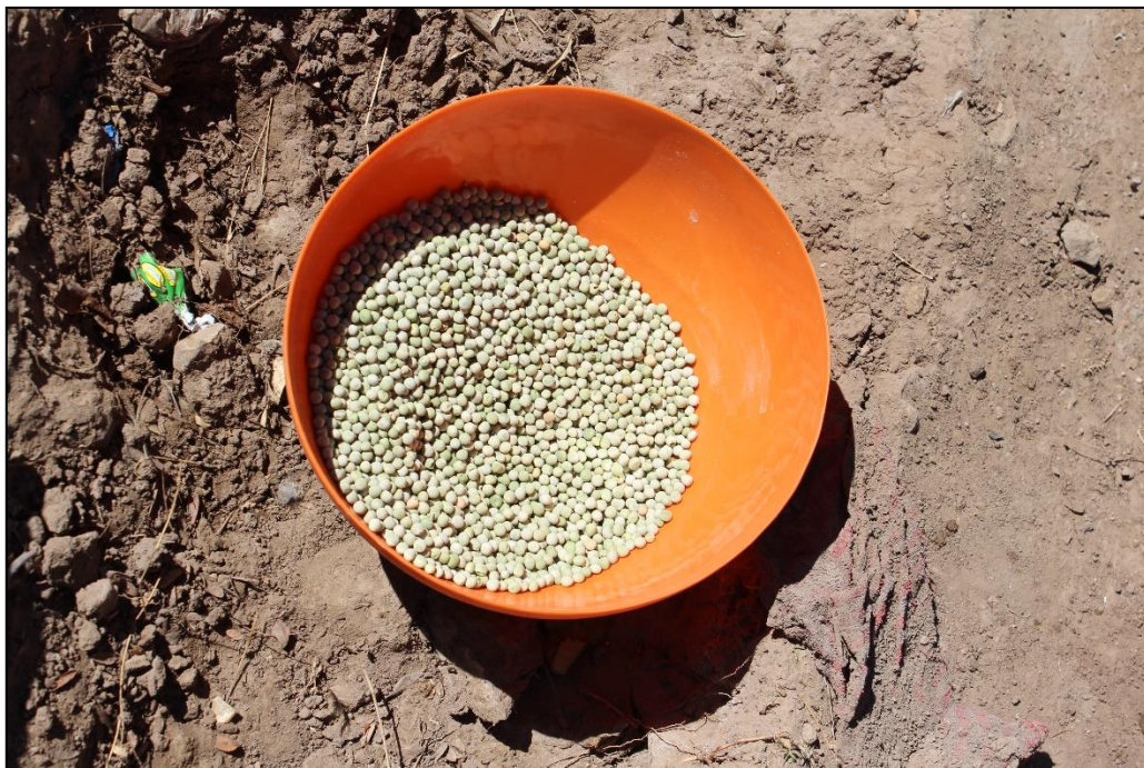
Photo 9: Seeds harvested on the farm of one of the community seed bank members, Sterkspruit.