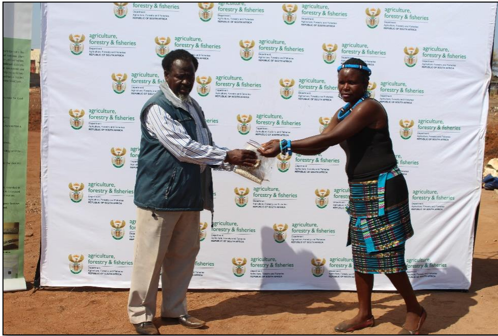
Photo 10: Food fair and seed exchange at the Gumbu celebration.