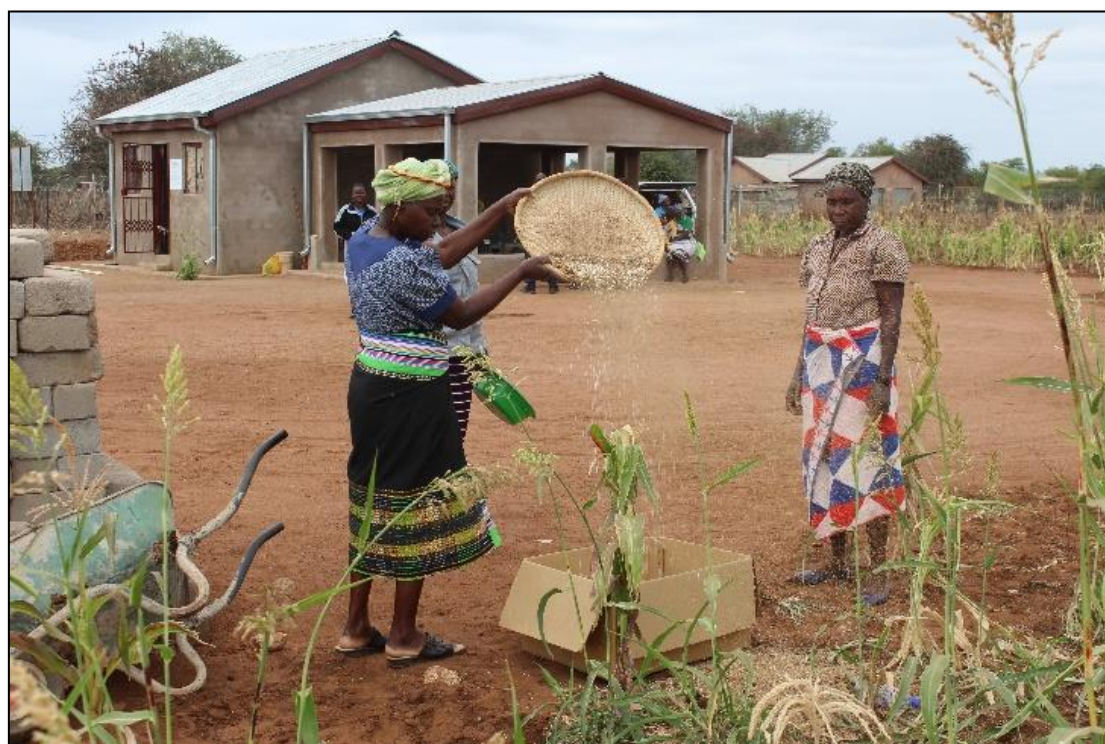
Photo 3. Cleaning seeds to be stored in the Gumbu community seedbank.