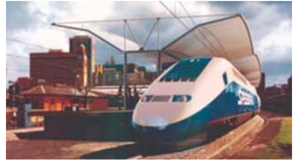
An image from the 1990s of a SpeedRail train at Central Station.

and Canberra was proposed in the mid-1990s. With some federal government encouragement, it was studied, with detailed design. It was costed at about $4.5 billion, with finance arranged for some $3.5 billion. The Howard government would not fund the balance and commissioned yet another HSR study.