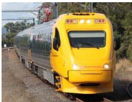
Queensland's Tilt Train intercity service has been running for nearly 20 years.

Many countries do not have high-speed rail, but have medium-speed rail (MSR) instead. These countries include Sweden, Switzerland, the United States and Canada.