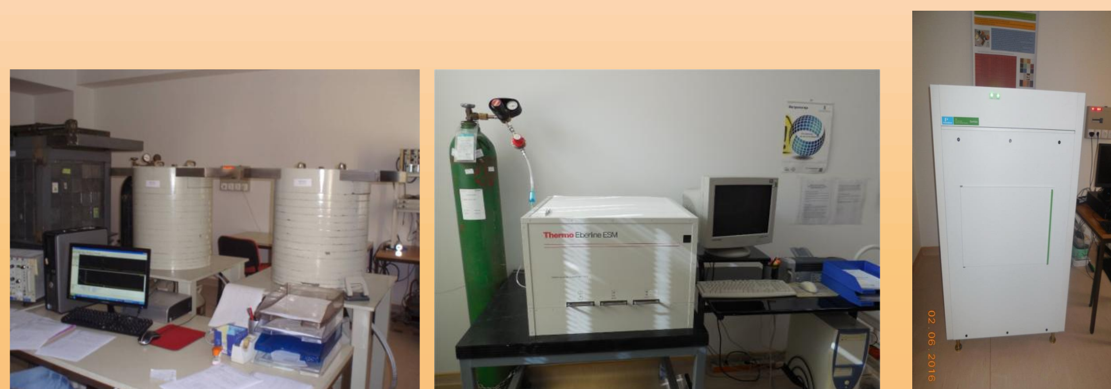
Figure 2. Measuring instrumentation: gamma spectrometer, proportional counter for 90 Sr and Quantulus.

Preparation of soil and sediment samples for gamma spectrometry analysis included drying at 105 \text{ }^\circ\text{C} , and sieving and for 90 Sr determination included mineralization at 500 \text{ }^\circ\text{C} . In all samples radioactive equilibrium was established. Analysis of water samples for gamma spectrometry analysis and determination of 90 Sr included evaporation of about 20 l until 200 ml. Determination of 3 H in water samples consist of distillation and electrolytic enrichment.