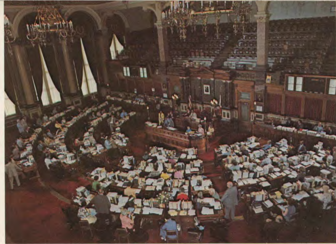
The Senate in Session.

Consideration of bills follows points of personal privilege in the House and consideration of gubernatorial nominations in the Senate. The order of consideration of bills is determined by the calendar of the body. As each bill is reported out by committee, it takes its place on the calendar of the body or on the Appropriations or Ways and Means calendar if the bill involves an appropriation or taxation measure. The