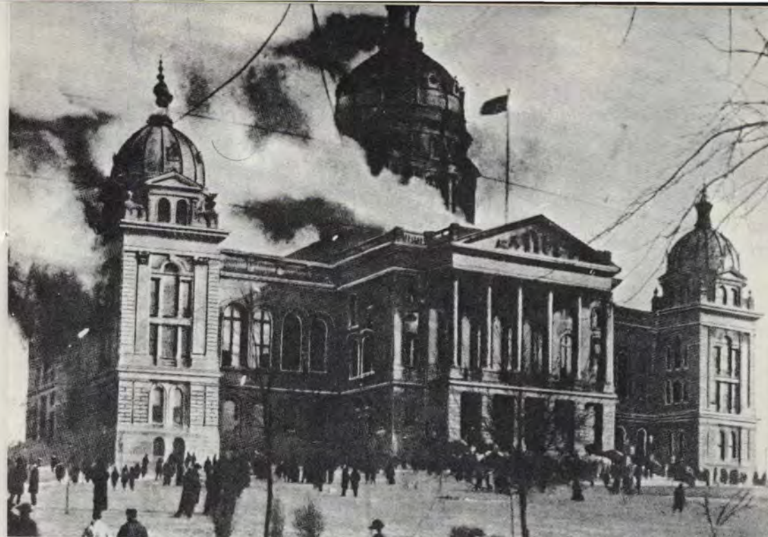
Fire in the House Chamber, 1904.

It is for us all a source of profound gratification that from the day when the present commissioners assumed control with their accomplished Superintendent of Construction, the legislative bodies have never withdrawn from them their confidence. Not one act of speculation or spoliation, not one coin wasted or vainly spent has defaced the bright record of their administration. It shall be a part of the legacy we leave our children that all these vast and durable walls have been laid in the cement of honesty, and built by the rule of fidelity. More proud of this legend are we than of all these classic columns and brilliant domes which please the eye and gratify the taste.