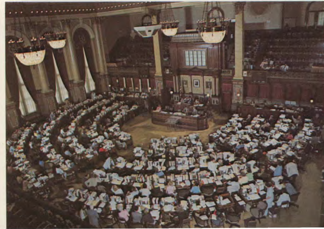
The House in Session.