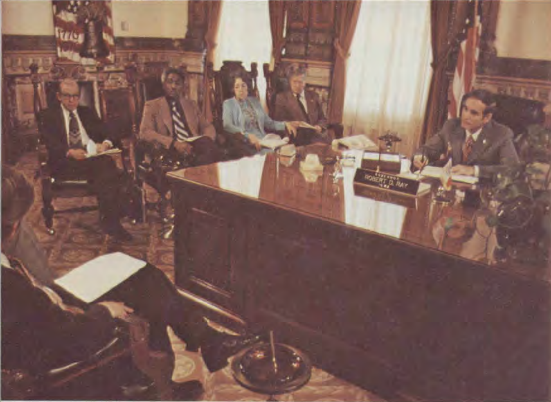
Governor Robert D. Ray meeting with visitors to his office