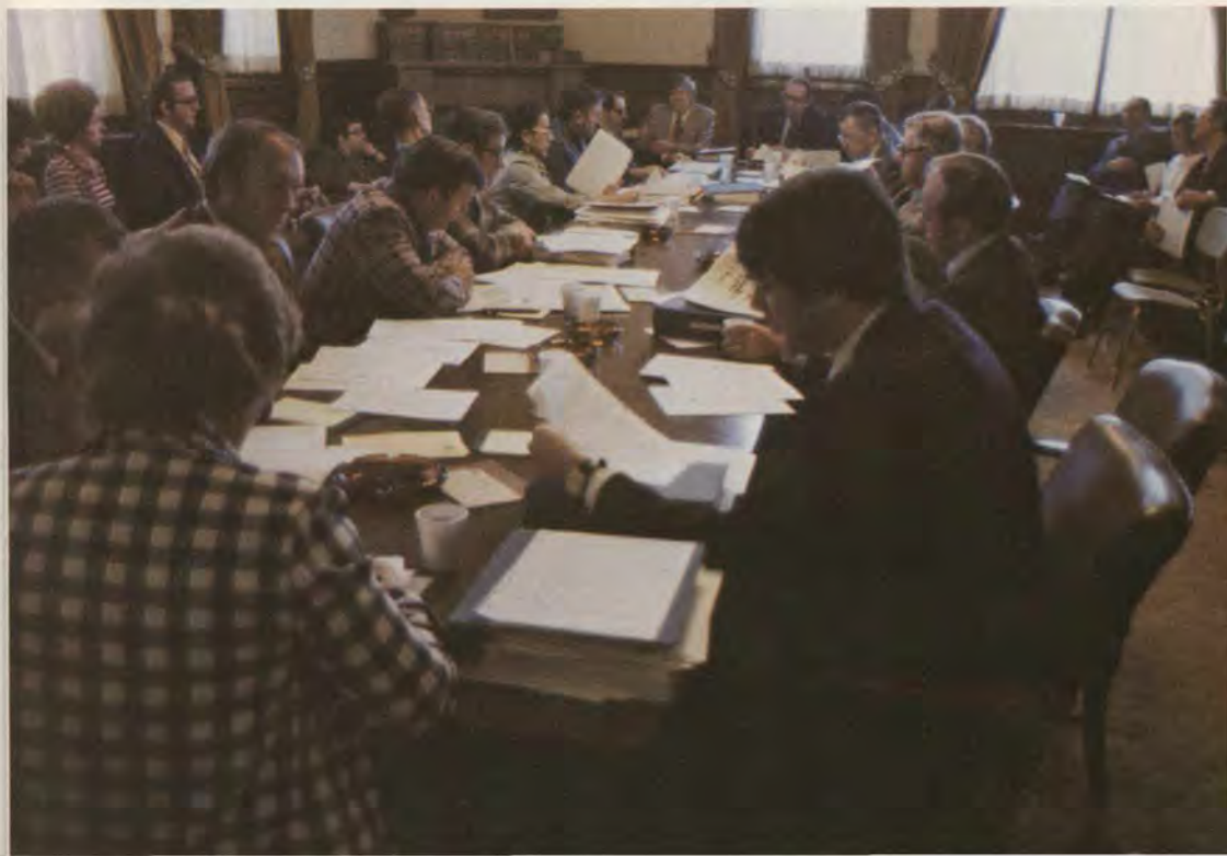
The Legislative Council in session

The Senate and House Legal Counsels are the legal officers for each body. A Senator or Representative may wish to consult with them over problems of the meaning of existing statutes or proposed bills. The counsel may be asked to furnish them with a brief on the law regarding the issue.