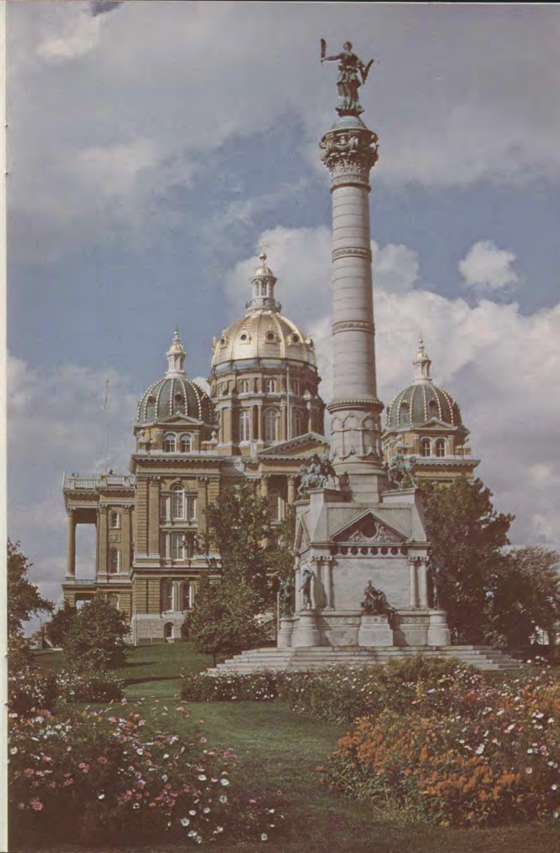
Statehouse from the south showing the Soldiers' and Sailors' Monument

Iowa has been and continues to be a leader in agricultural production. This fact, coupled with increasing industrial development opening up more economic opportunities, makes Iowa truly "a place to grow."