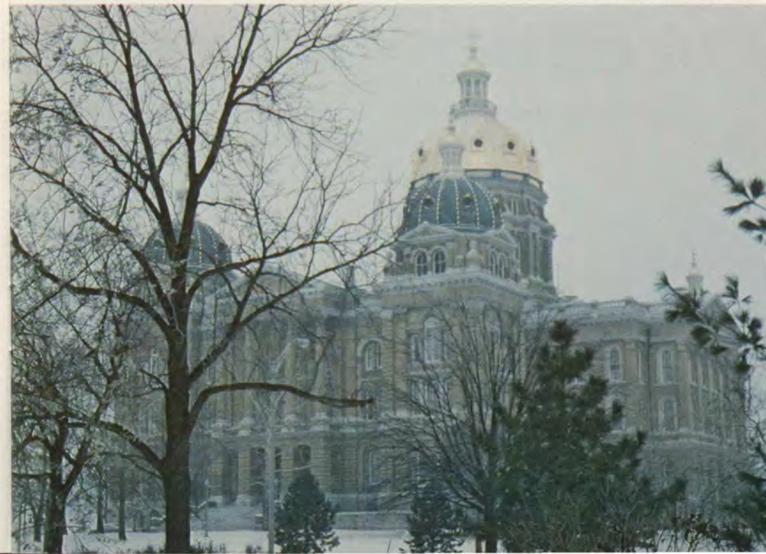
The Capitol in Winter

"Food will win the war" also became a popular slogan of the time, and farmers were granted loans and price supports as incentives for the purchase of more land and more production. Unfortunately, this productivity resulted in massive surpluses of grain. Then when the subsidies were removed in 1920, the bottom dropped out of the farm