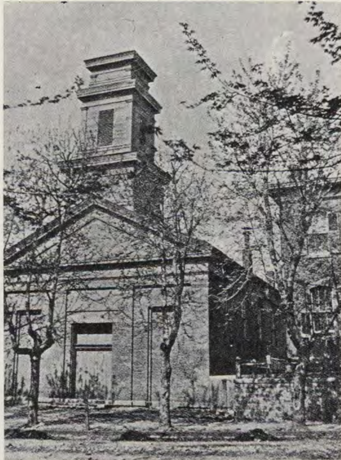
Old Zion Church, Burlington.

near the geographical center . . . and be consistent with the interest of the state, generally."