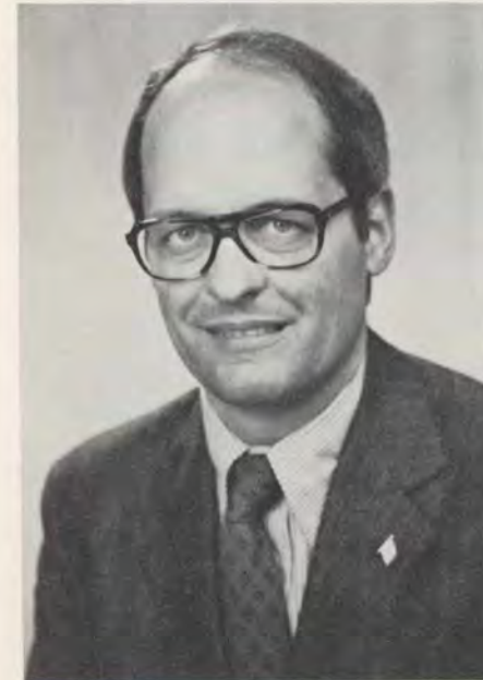
Lieutenant Governor Arthur A. Neu

Between the session and interim business, legislators are continually busy. Despite that, they always desire to meet with their constituents. When you visit the Capitol, be sure to contact your Senator or Representative.