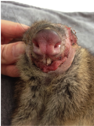
Fig. 4. Frontal view of the head of the woylie, showing thickened and inflamed lip margins.