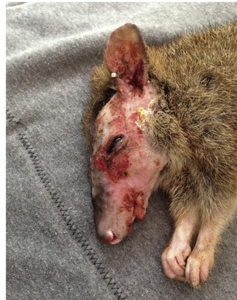
Fig. 2. Lateral view of the head of the woylie, showing severe hair loss and inflammation, patchy haemorrhage (top of head, ears and mouth), and crusting.

Veterinary examination in the field determined that this woylie was in extremely poor body condition (subjective body condition score 1.5/5 based on palpation of muscle mass/fat over the hindquarters), although body weight was within the normal adult range (1270 grams). Severe generalised musculoadipose atrophy was confirmed on internal gross examination. There was severe, diffuse alopecia and inflammation affecting the skin of the head and chin, with patchy haemorrhage (top of head, ears and mouth) and crusting (Figs. 2 and 3). The lip margins were severely thickened and inflamed (Figs. 3 and 4). Severe hair loss also affected the hindlimbs (medial thighs, tibia), tail base and tail (Fig. 5) and mild skin thickening/flaking was evident over the flanks and rump. The woylie was subjectively graded with a heavy burden of lice/lice eggs and a moderate burden of fleas, ticks and mites.