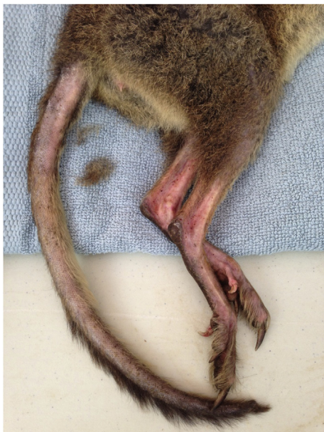
Fig. 5. Lateral view of the woylie, depicting hair loss over the hindlimbs (medial thighs, tibia), tail base and tail (proximal 2 inches of tail have been clipped for blood collection) with scabbing/skin flakes evident over the flanks and rump.

liver. Trypanosoma copemani G2 was identified using subsequent DNA sequencing in all of these samples. PCR and DNA sequencing also revealed Sarcocystis sp. within the bone marrow, skeletal muscle, tongue, heart, oesophagus and spleen. Toxoplasma gondii was not detected.