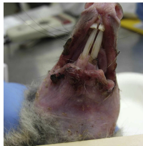
Fig. 3. Ventral view of the head of the woylie, showing severe, diffuse hair loss and inflammation affecting the chin. Excoriated, thickened lip margins are also visible.