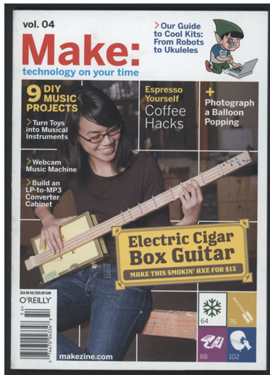
Figure 1 Cover of Make: Technology on Your Time , Vol. 4, 2005.

Though people have been making cigar box guitars for over a century, and the instruments have clearly influenced today's popular music, it is not a practice that seems to have caught on in the UK before the appearance of Seasick Steve. The advent of the Internet, though, has enabled the activity to be far more easily accessed across geographic boundaries (as will be shown), and American magazines, such as Make: Technology on Your Time , which is part of a much wider growth of interest in DIY and maker culture, find a ready audience in the UK (Figure 1).