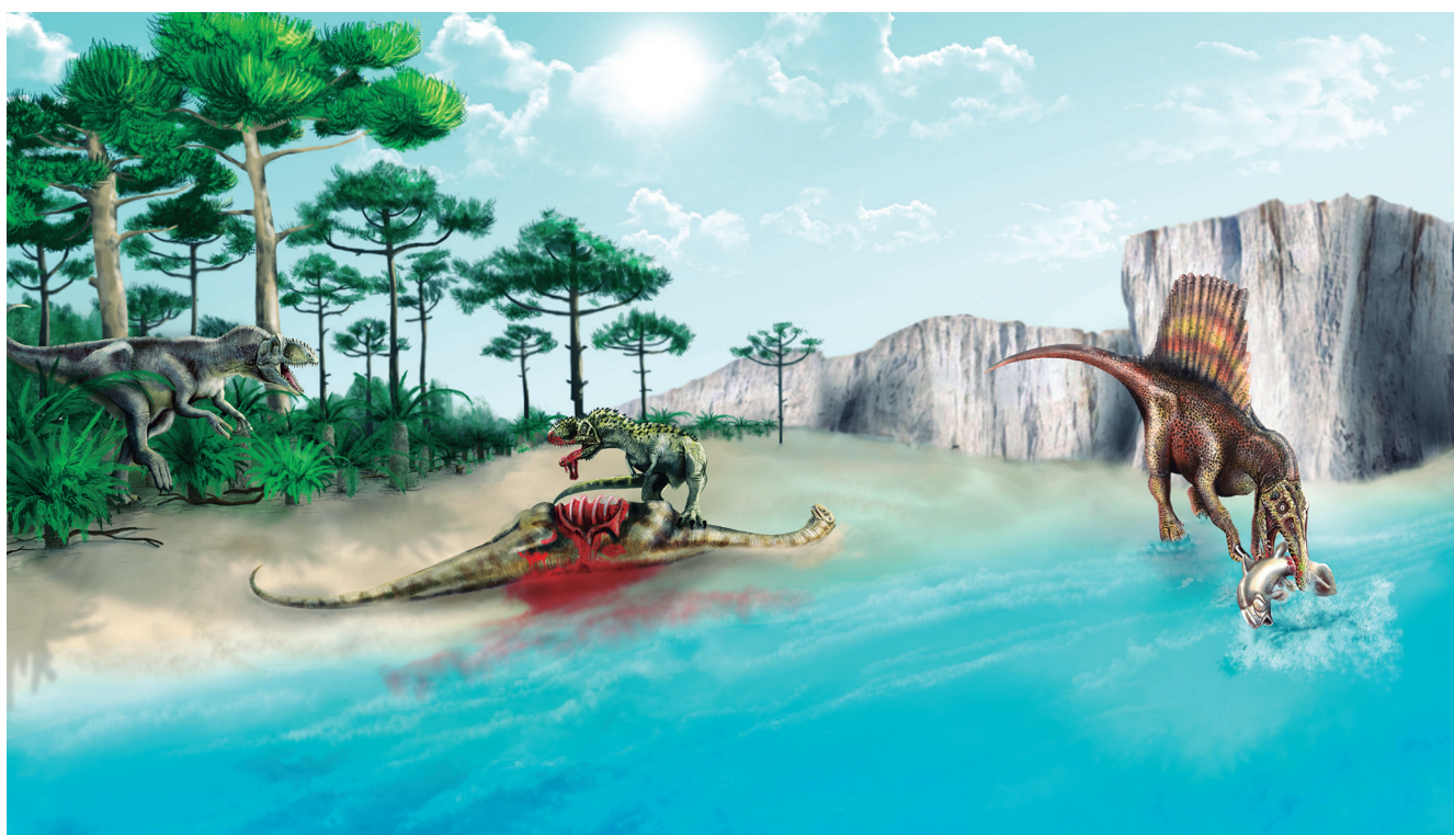
Figure 3. Paleoenvironmental reconstruction of large theropods from middle Cretaceous North Africa showing carcharodontosaurid (left), abelisaurid (middle) and spinosaurid theropod (right) feeding. Drawing made by L. Vidal.