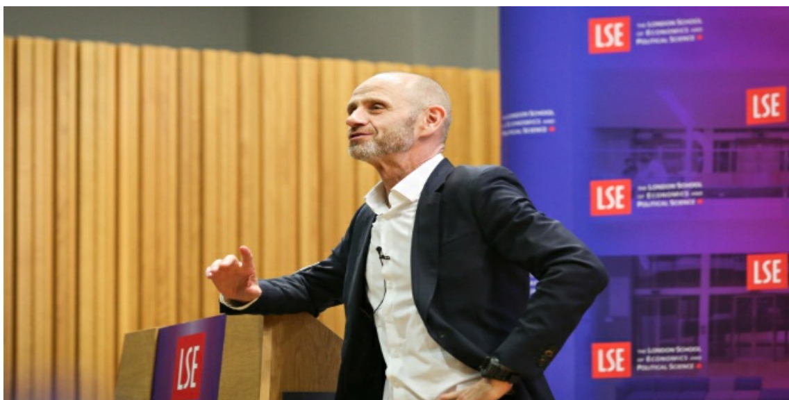
Image Credit: Author Evan Davis at LSE Institute of Public Affairs and Polis Lecture on 'Post-Truth', 18 October 2017 ( © LSE in Pictures .)

Certainly, such everyday bullshit should not be perceived exclusively negatively – and Davis is very good at demonstrating numerous cases of positive, or at least neutral, bullshit, such as ‘white lies’ in complimenting a friend for a dessert they have ruined in order not to offend their feelings – but it still piles up, demonstrating that, actually, bullshit is all around. Indeed, as Davis states in the introduction, post-truth is nothing other than carefully calculated strategies to attract attention in a bullshit-permeated environment, and is therefore ‘rooted in styles of communication that we are familiar with and we all use’ (xiii). Hence, bullshit – the enabling factor of post-truth – is a collusion in which everyone participates.