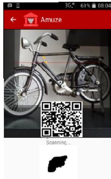
Fig. 6. QR Code Scan for the Answer

Special for silhouette adventure game, user is assigned to guess and look for objects that seen on the silhouette image list (Figure 5). User answers the question by scanning the QR code tag that attached on the artefacts (Figure 6). By this method users will interact with objects in the museum.