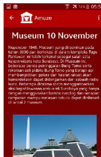
(b) Museum General Information