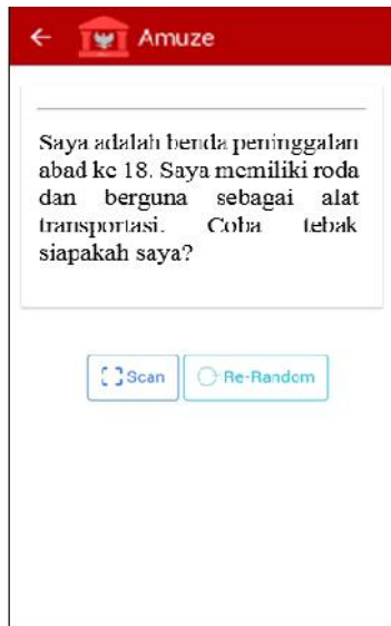
Fig. 7. Riddle Quest Game

Finally, our try to test this research to 50 museum visitors, with 10% respondents from range age 5 to 10, 25% respondents from range age 11 to 20, 50% respondents from range age 21 to 40, and 20% respondents from range age 41 to 50. All respondents considered that this game application has been able to make their visit to the museum more interesting. The silhouette guess and riddle quest game get the first and second rating as the game most appealing to the respondents. Respondents assess this game is able to attract the visitors to go around the museum and understand more about the artifacts in the museum. So, we could conclude that this fun-game application using mobile device and QR code could give a fun, exciting, and interesting visit for museum visitors.