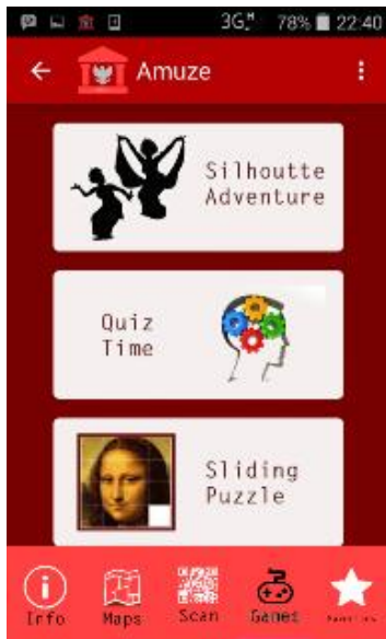
Fig. 3. Games Option