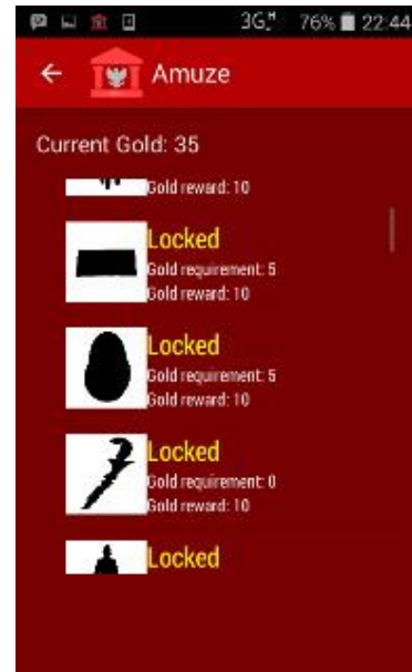
Fig. 5. Silhoutte Image List