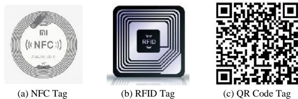
Fig. 1. Identification Tags

Beside the QR code, there are several alternative (other tags) technology that could be used, such as RFID tags and NFC tags (Figure 1). Both of these technologies have advantages where the tags also can store information (not just representative the code only). But both of these technologies require specific devices to access the information. It also takes special tools and expertise to enter information into tags.