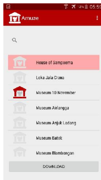
(a) Museum List Menu

First the user can select the museum that they want to be visited from the list of existing museum data on the application (Figure 2.a.). Once selected, user can view and download the information data from that specific museum (Figure 2.b.).