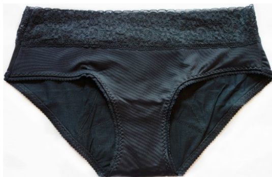
Figure 1 Thinx® brand menstrual underwear, Hiphugger style.

The qualitative sampling strategy was guided by Miles et al 13 recommendations. A minimum of 35 participants