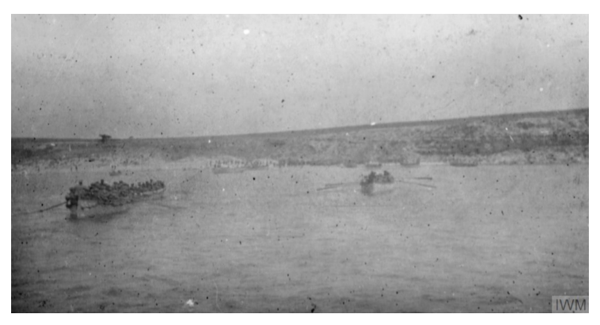
The first boatloads of men of 1st Battalion, Lancashire Fusiliers landing at 'W' Beach, to the west of Cape Helles. [© IWM (Q 102538)]

sucked in nine more Allied divisions by July, while the Turks rushed another 22 to the front. A late summer offensive on 6 August around Suvla Bay had pushed out the lines further into Turkish territory, but there was much confusion and inertia, and again no breakthrough. After this, there were no more large-scale offensives, although the casualties mounted and new troops were required.