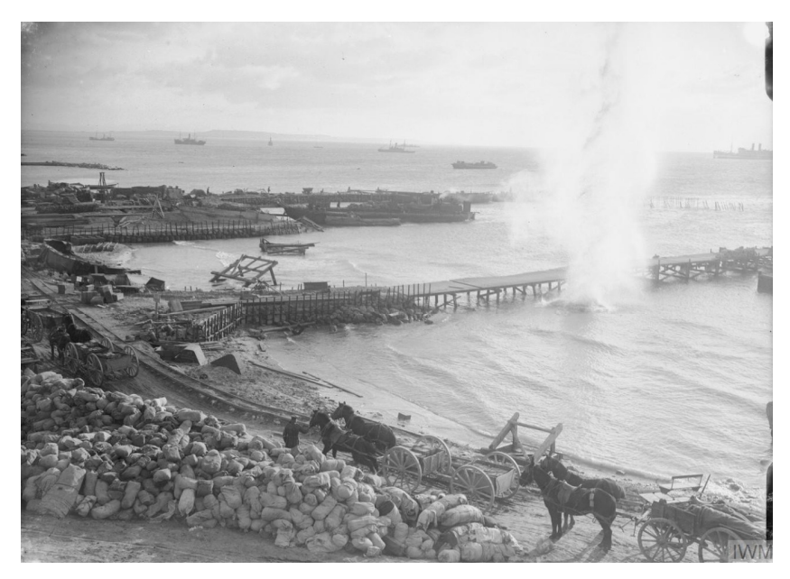
Shell from the Turkish guns bursting near one of the four Piers at Lancashire Landing, 'W' Beach, Cape Helles on the day of the evacuation, 8 January 1916.

of Bulgaria into the war in September 1915 on the side of Germany threatened Serbia and its defeat would allow Turkey to link up with Germany. In order to strengthen Serbia, the Allies moved a large force into Salonika, Greece, which drew down strength and resources from Gallipoli. From mid-October there was talk in the British cabinet of pulling out more troops from Gallipoli and a month later, on 23 November, the War Committee sensibly ordered an evacuation. A forced landing was one of the most difficult operations in a military campaign, but it was almost suicide to try an evacuation in an environment like Gallipoli, with armies in close contact. Even a gradual and secret withdrawal would likely result in a high number of captured and killed. But there were few other palatable choices, and it was planned that Suvla Bay and Anzac Cove were to be evacuated, followed by the southern tip around Cape Helles.