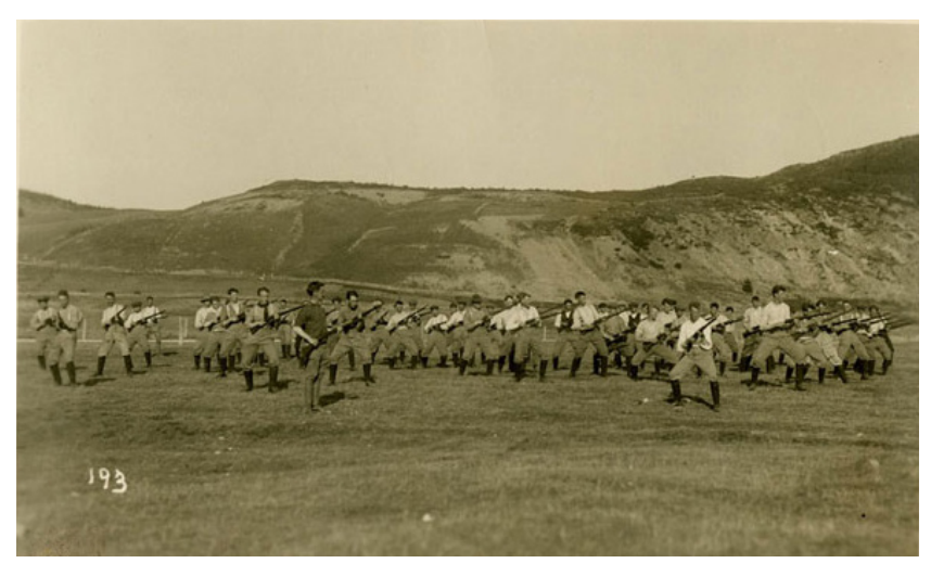
Volunteers of the First Five Hundred at bayonet exercises beside Quidi Vidi lake, 1914.

an infantry force, a first detachment of 537 men, aged nineteen to thirty-five, were ready to sail for the United Kingdom in early October 1914. Coaker may have been right as Newfoundland was all but impoverished. In hundreds of outports, people were used to hard times and in the autumn of 1914, records show that about 250 additional recruits had to be turned down due to poor health—everything from chronic illnesses like rickets and pellagra to flat feet and poor teeth. There was, though, no lack of patriotic spirit. Those who enlisted did so for numerous reasons, from supporting the Empire to escaping the hardscrabble life on the island, or for steady pay, a chance to travel, and to represent Newfoundland in the global war effort. Many believed in the just nature of the war against German aggression. One popular parish priest, Father Larry of Ferryland, was reported as exhorting his flock, "These Germans, shoot them! Kick them to blue blazes!"