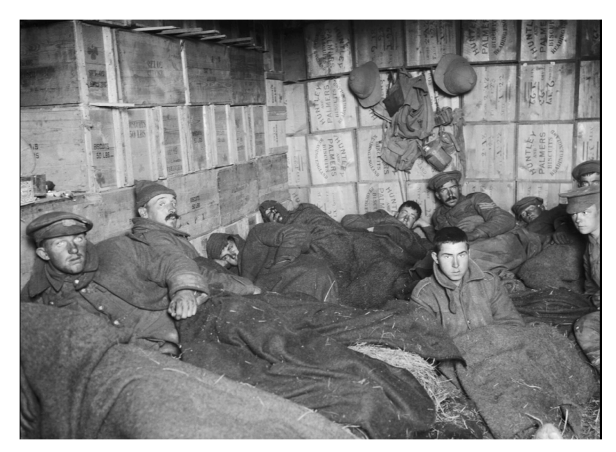
Frost-bitten soldiers lying on straw in shelters constructed of biscuit boxes at a store dump at Suvla, after the frost at the end of November 1915.