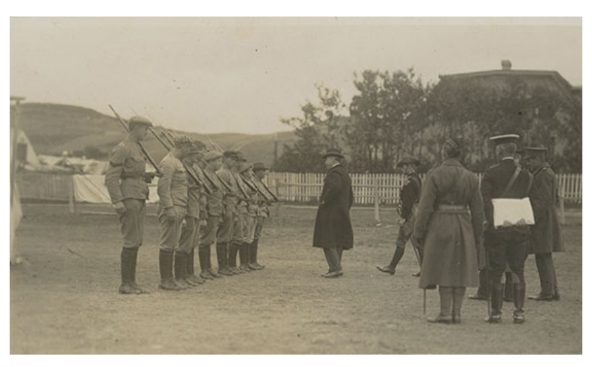
Governor Walter Davidson inspecting a section of Newfoundland Regiment recruits. Note the rudimentary uniforms, civilian headwear, and blue puttees.

government immediately pledged support to London even though the Dominion had no permanent military force nor a militia around with which to form an expeditionary force. It did have a quasi-military Legion of Frontiersman, along with several church-sponsored paramilitary voluntary organizations and youth movements that combined moral teachings with military drill.<sup>11</sup> However, with the exception of the Legion of Frontiersman, which had a presence at the village of St. Anthony, all were based in St. John's.<sup>12</sup> In the capital, Catholics, Anglicans, Methodists, and Non-Conformists all vied to train boys for war and, over the previous decade, this had created a cadre of military-minded young men.<sup>13</sup>