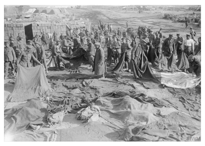
British troops drying blankets at Suvla Bay after the storm at the end of November 1915.