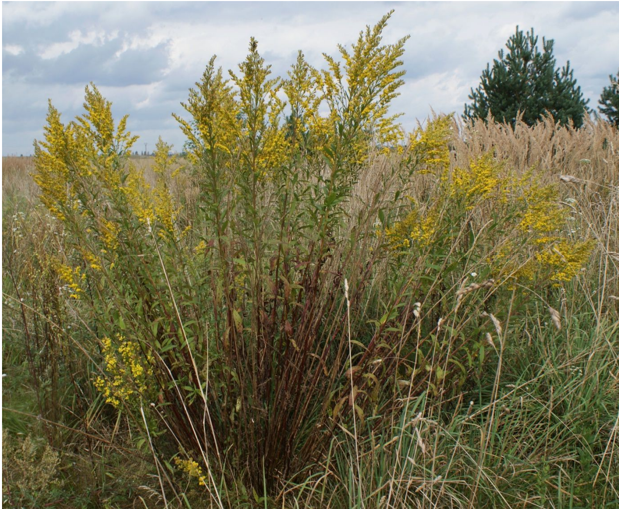
Fig 2: Solidago x niedereideri on an abandoned field near Suwałki, NE Poland (photo by A. Pliszko, 18 Aug 2014).