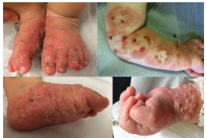
Figure 1. Clinical aspect of the lesions.

A 5-month-old girl was observed by her pediatrician because of vesicles and blisters located on the hands, feet, and mouth. She was diagnosed as having hand-foot-mouth disease. Owing to the appearance of new lesions during the following 2 weeks, she was presented to our dermatology department with