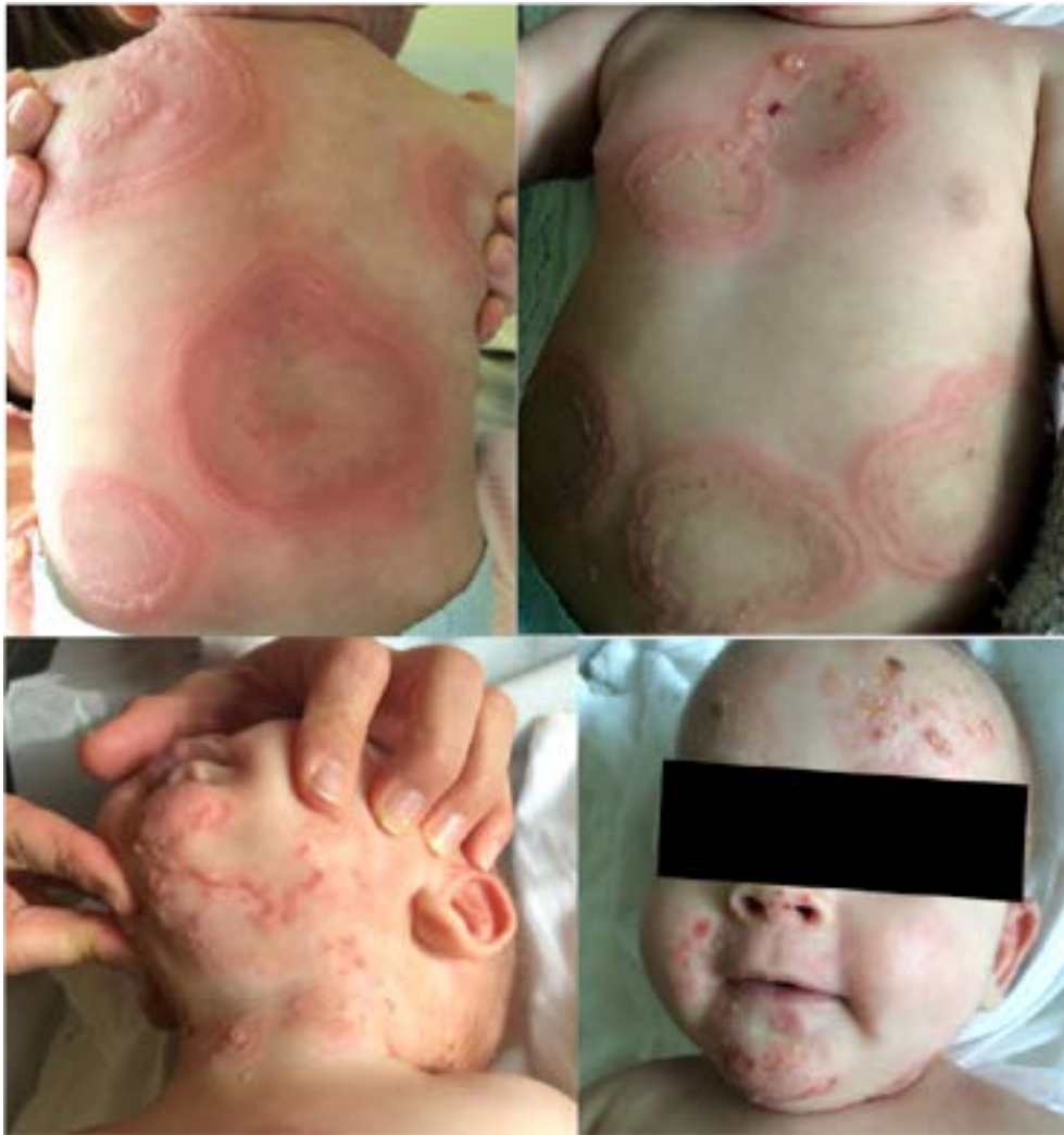
Figure 2. Clinical aspect of the lesions.