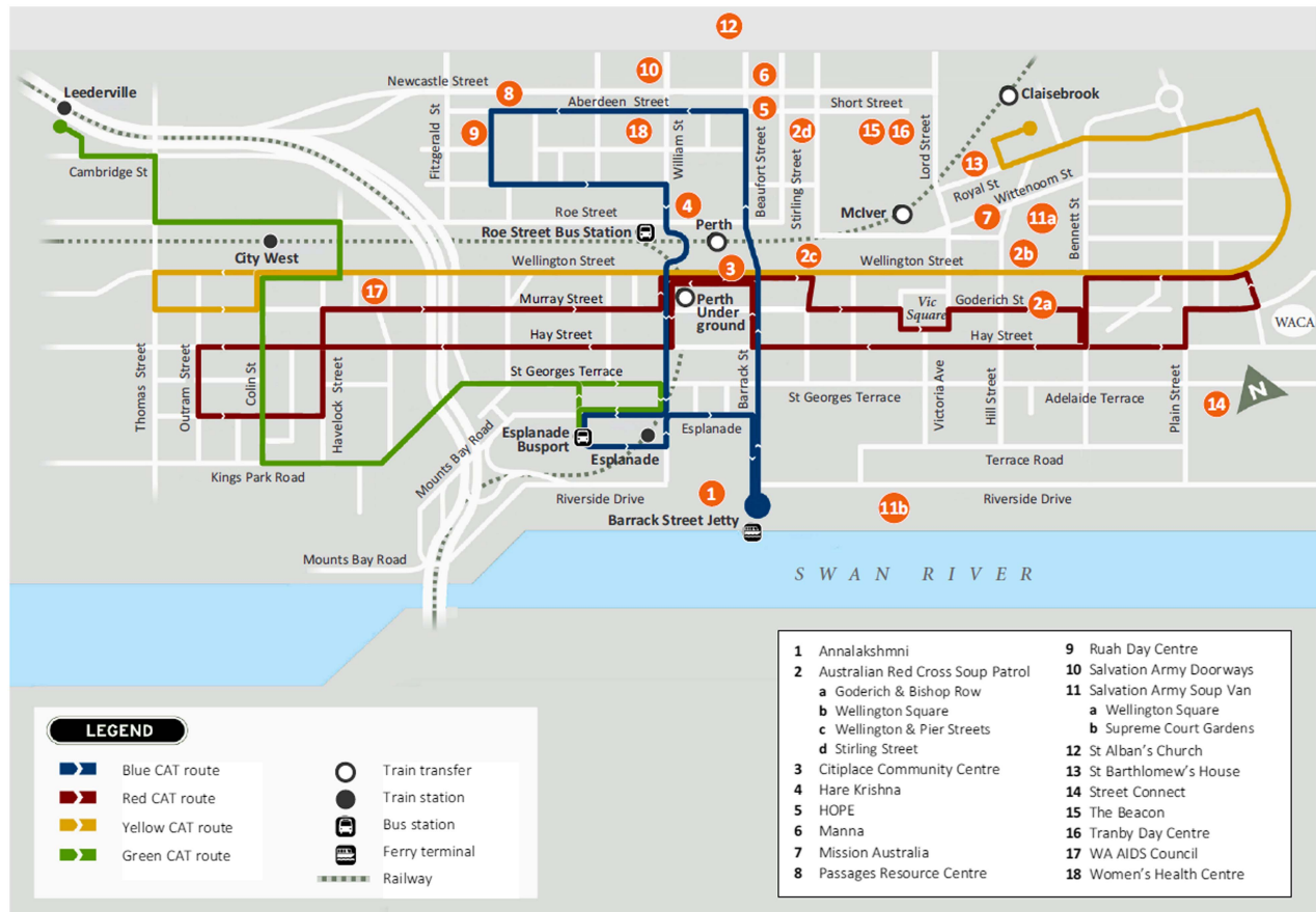
Fig. 1 Map of charitable food services in inner-city Perth, Western Australia, after disclosure of service locations used by interviewees, February 2016