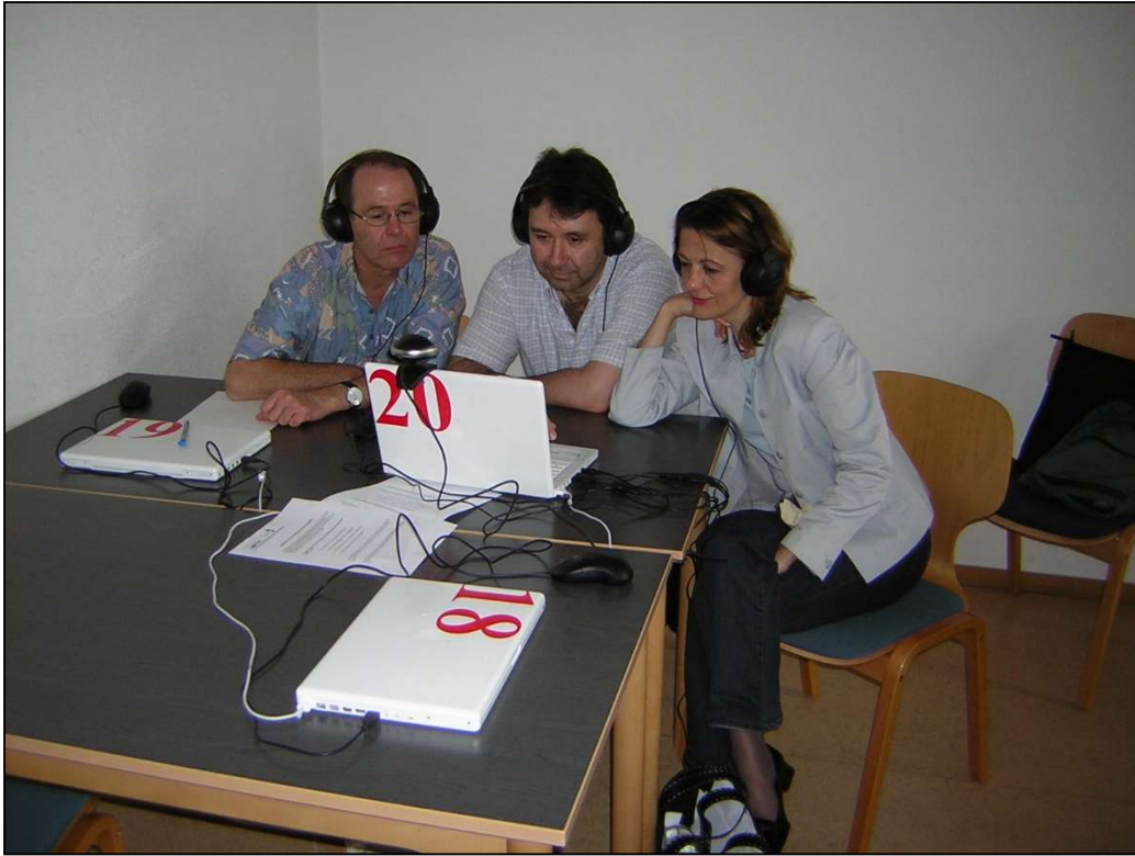
Figure 2. In-service teachers during the collaborative small group phase.