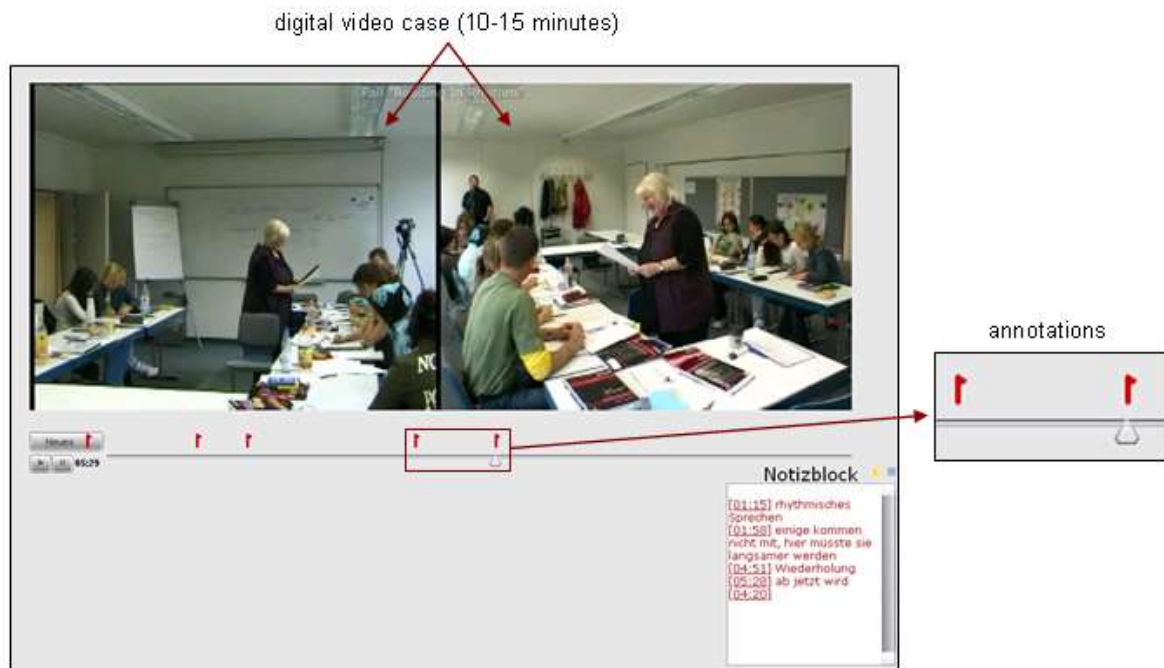
Figure 1. The computer-supported learning environment.