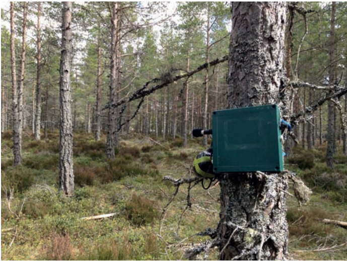
Figure 3. The use of bioacoustics is common practice for bat surveyors, but could be used effectively by ecologists studying other groups of species. Here an acoustic recorder is deployed to record capercaillie Tetrao urogallus in north-east Scotland.