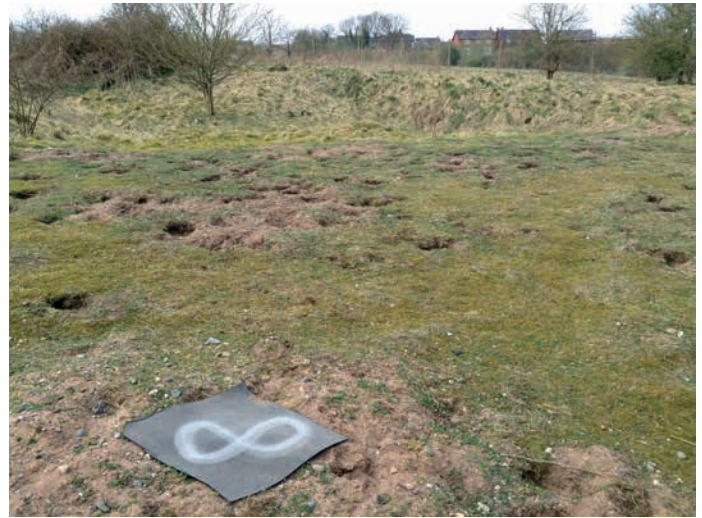
Figure 4. The use of artificial cover objects (ACO) has long been the mainstay of reptile surveys. In the absence of rigorous scientific testing, there are still disagreements over the number, material and colour of ACOs that should be used.

1983). This method is useful for providing detailed information on the distribution of bird territories, but is time-consuming, and difficult to apply and interpret. As there is no set number of site visits for this method when used by consultants, the number of surveys carried out within EclA studies is often determined by the consultant's qualitative assessment of the site or their own established practice. The appropriate level of survey effort required to accurately assess the composition and species-richness of a bird assemblage in a particular location has not been determined in many cases (Calladine et al. 2009). In addition, territory mapping may not even be the best option for EclA purposes: point counts, line transects or bioacoustic recording might provide equal or better quality data, and probably with less survey effort (Figure 3) (Abrahams and Denny 2018; Gregory et al. 2004).