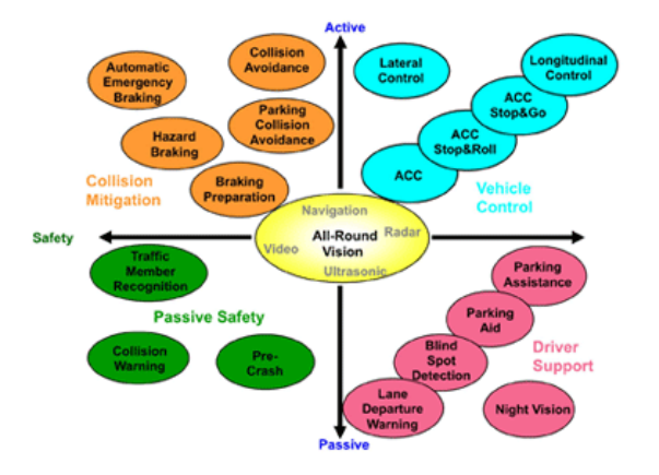
Figure 1: The ADAS evolution and its impact (Troppmann, 2006)

obtain such benefits as illustrated in Figure 1. That is, whether the stated safety benefits can be obtained by simply activating the relevant ADAS or through communications to drivers. For example, an active safety ADAS will take over the control of the vehicle once it has been activated while ADAS providing passive safety only make the driver aware of potential hazards in the surrounding environment. This research focuses on the latter as it involves information provision of ADAS.