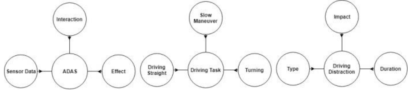
Figure 2: Ontology of ADAS, driving task and driving distraction

The revised ontology resulting from the focus group study is shown in Figure 2.