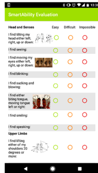
Figure 4: Prototype SmartAbility Application requiring manual user input

Based on the knowledge and mappings contained