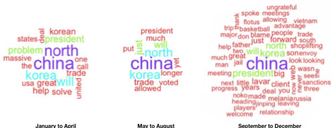
Figure 3 – Trump's Tweets about China (2017)

Paralleling this development is that of the growing domestic concern that an 'America First' policy will translate into a diminishing American presence in East Asia, leaving space for an ambitious China to grow its influence. In response, Trump has stated that he is open to the United States re-joining the Trans-Pacific Partnership Pact (TPP) if countries "made a much better deal". We should therefore prepare ourselves for more Tweets from @realDonaldTrump on the subject of trade in East Asia, particularly with regards to China.