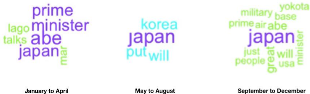
Figure 4 – Trump's Tweets about Japan (2017)