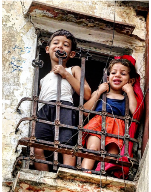
Children survey the Kasbah of Algiers