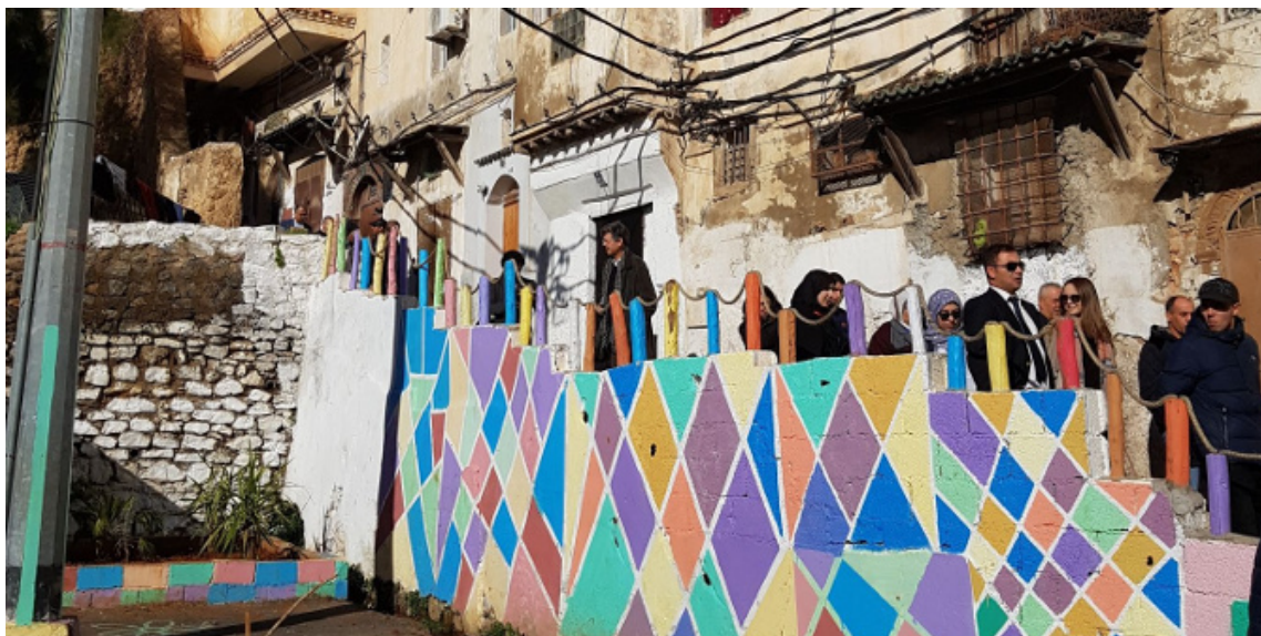
Community art inside the Kasbah of Algiers

A key element of urban citizenship in the Arab world, the cultural heritage of the medinas is considered a vital source of diversity. Both its morphology and typology are seen as potential avenues for rethinking urban models: they are dense, compact, and mainly pedestrianised. Importantly, they contain a rich and diversified sociability, combining traditional and contemporary elements to form a proud mosaic of human experience that thrives at the margins of the city.