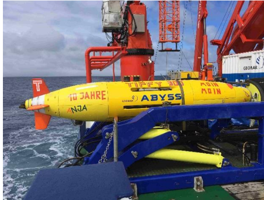
"Tiffany" loaded into the launching system and ready for her 300 th dive

We also were able to celebrate a milestone event on Friday – the 300 th dive of the AUV (or "Tiffany" as she is affectionately known to all on board). The team decorated the vehicle nicely for this event and sent her off for another successful dive. Since GEOMAR acquired the AUV in 2008 with the help of funding from the DFG, it has spent 3.500 hours underwater and traversed over 18.000 km of seafloor, making it one of the most successful vehicles of its type anywhere in the world. Its longest ever dive occurred on this cruise, with a record 137km "flown" in one 24-hour dive. A cruise of the type we are performing would be almost impossible to achieve without such a vehicle.