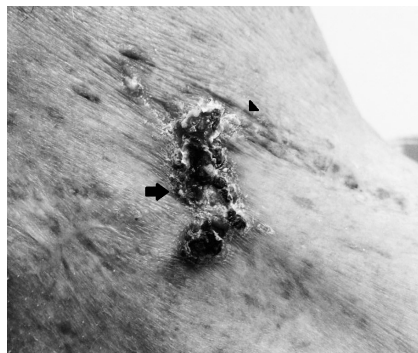
Figure 1: Ulcerated necrotic plaque (arrow) within a papular lesion in a linear distribution (arrowhead) over the left side of patient's neck, with surrounding erythema.

A 79-year-old male presented with several papular lesions in a linear distribution at the left side of his neck measuring 2 x 4 cm. The papular lesions had been present since childhood, but later coalesced and gradually enlarged and thickened. Within the past few months the papular lesions were pruritic with contact bleeding and became ulcerated with crust formation (Figure 1). Based on the history and