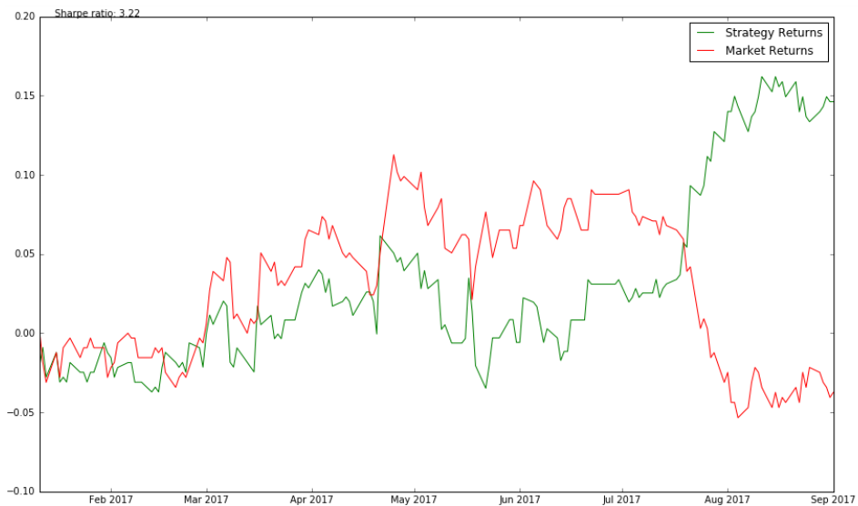
Fig. 2. The strategy cummulative return using GMM-SVM.

This strategy works on some stocks (i.e. ASII.JK—Astra International Inc. Resulting sharpe ratio of 3.22) but doesn't work on others, which is the case with most prominent other strategies. There are a few reasons why the algorithm did work consistently and the author will list some of them here: i) No autocorrelation of returns; ii) No Support Vector hyper parameter optimization; iii) No error propagation; and iv) No feature selection. The autocorrelation of the returns have not checked yet, which would have increased the predictability of the algorithm. The returns column was shifted by one and passing it as feature set. The result will increase the sharpe ration by 5 %.