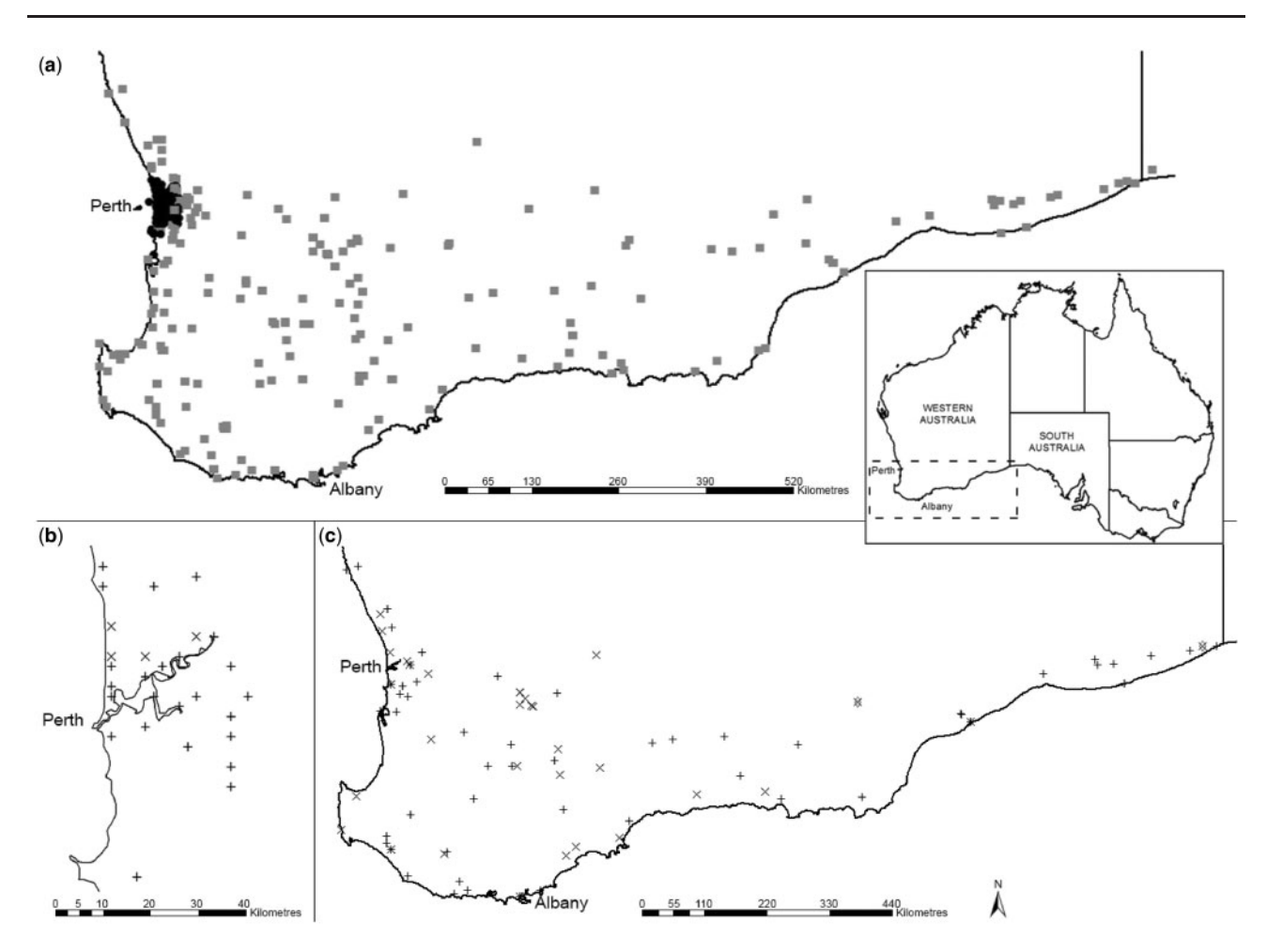
Figure 1. Collection locations of dugite P. affinis specimens used for this study: a) urban specimens (around the Perth metropolitan area where human population density exceeded 500 persons km<sup>2</sup> at the time of the nearest Australian Bureau of Statistics census) are indicated by black dots, non-urban specimens are shown with grey squares; distribution of dugites containing prey in gut contents for b) urban and c) non-urban specimens. Legend: cross—non-native rodents; diamond—native rodents; plus—reptiles. Study location with reference to the wider Australian continent is shown in center right.

where there have been local prey extinctions recorded as a result of predation pressure (Savidge 1988). By contrast, P. sebae in suburban areas in Nigeria supplement their diet with synanthropic rats and domesticated poultry, but are significantly smaller than conspecifics from non-urban environments: the authors did not suggest any reason for this difference (Luiselli et al. 2001). In the present study, we investigate the effect of urbanization on the feeding ecology of the dugite Pseudonaja affinis, Elapidae (Günther 1872). This species is one of the most common snakes of south-west Western Australia, thriving in woodlands, heaths, and urban environments (Chapman and Dell 1985), possibly via supplementation from the spread of the invasive house mouse Mus musculus (Shine 1989). Although the house mouse is a small species, it is larger than the majority of urban lizards in Western Australia (How and Dell 2000), and its communal nesting and prolific breeding (e.g., Gomez et al. 2008; Vadell et al. 2010) appears to provide dugites with frequent opportunities to eat multiple individuals (and therefore larger meals). Dugites are regarded as one of the best urban-adapted large-bodied reptiles in Australia (How and Dell 1993), which makes them ideal model animals for urban/non-urban comparisons. Assuming dugites benefit from the presence of synanthropic rodents, then we make the