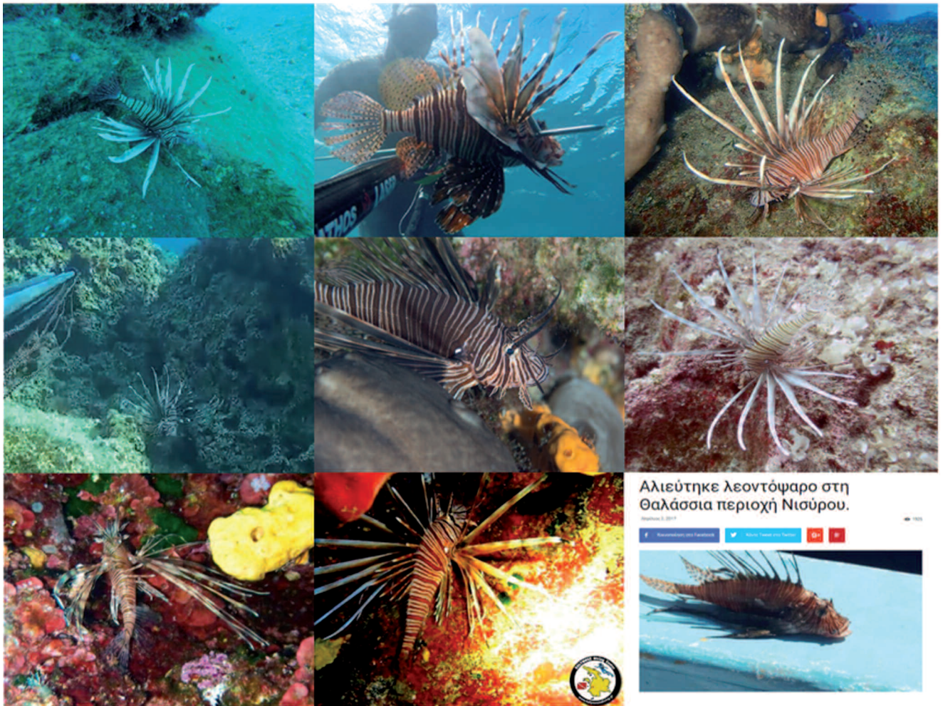
Figure 3. Pterois miles . Some of the pictures accompanied the report of P. miles in the database of the project.

Southern Aegean Sea, with record 17 (in Kalymnos island) being the northernmost Mediterranean lionfish encounter up to date. It should be noted that, the expansion data presented within this study, closely follow the predictions of Poursanidis (2015), as these were described as potential suitable areas for the species in the Mediterranean Sea through ecological niche modelling.