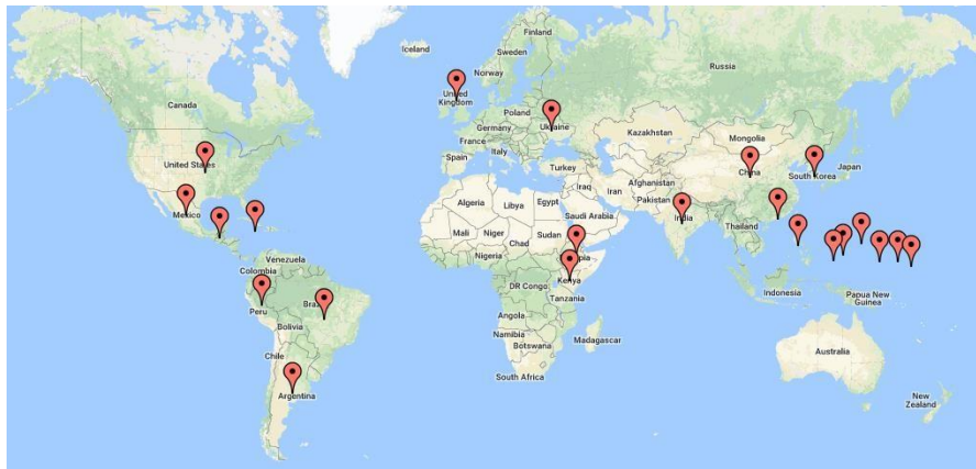
Fig. 1. Illustration of where the participants were born

The data from 71 participants were used. The participants were born in several countries across the globe and migrated to the United States and U.S. territories. Birth countries of our population are shown in Figure 1.