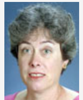
Margaret Mills Professor of Near Eastern Languages and Cultures