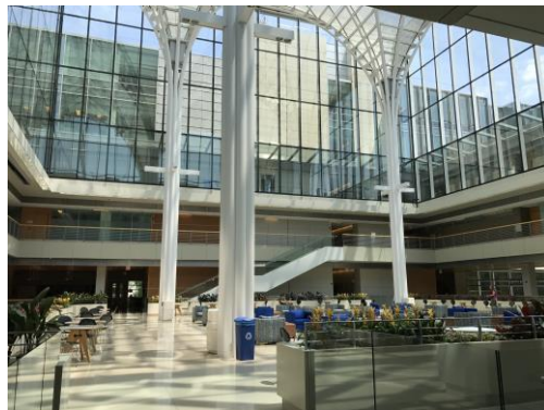
Booth School of Business