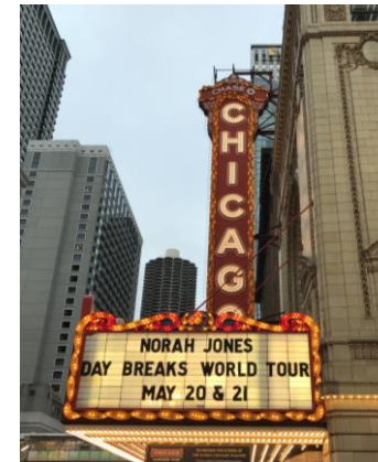
The Chicago Theatre