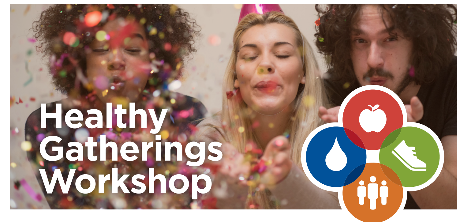
Learn the 6 steps to hosting meetings, events and celebrations that promote healthy eating, physical activity and smoke-free environments.

Over the past year GHKC has developed the “Healthy Gatherings” resources. The “Healthy Gatherings” campaign promotes healthy eating, physical activity and smoke-free environments at meetings, events and celebrations. Since the launch of the campaign in late 2015, GHKC has