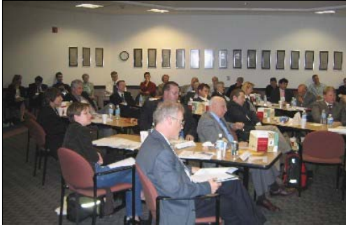
About 50 people attended the Ostpolitik conference from Ohio State and other universities across Ohio and around the world.