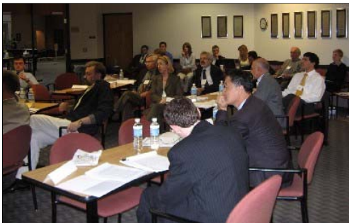
The Ostpolitik conference included participants from Britain, Czechoslovakia, France, Germany, Poland, Russia, South Africa, South Korea and the United States.