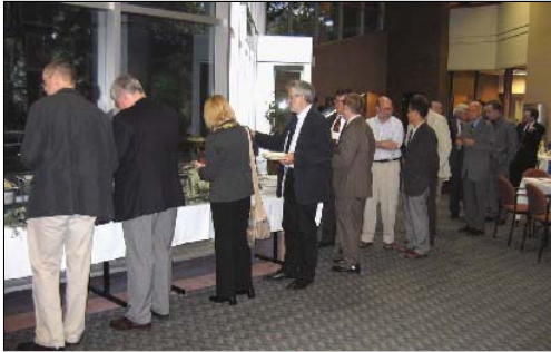
Conference participants were treated to a special dinner and performance on the evening of May 12.

at the Mershon Center for International Security Studies.