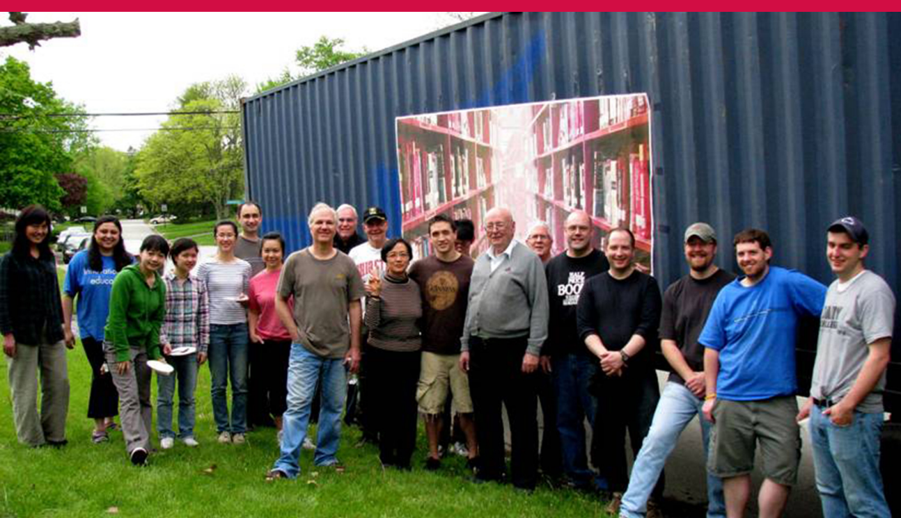
Books loaded by volunteers