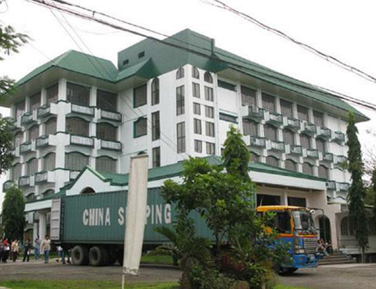
Unloading of 40ft container at Cavite University in Philippines; Ockerman Hall in the background