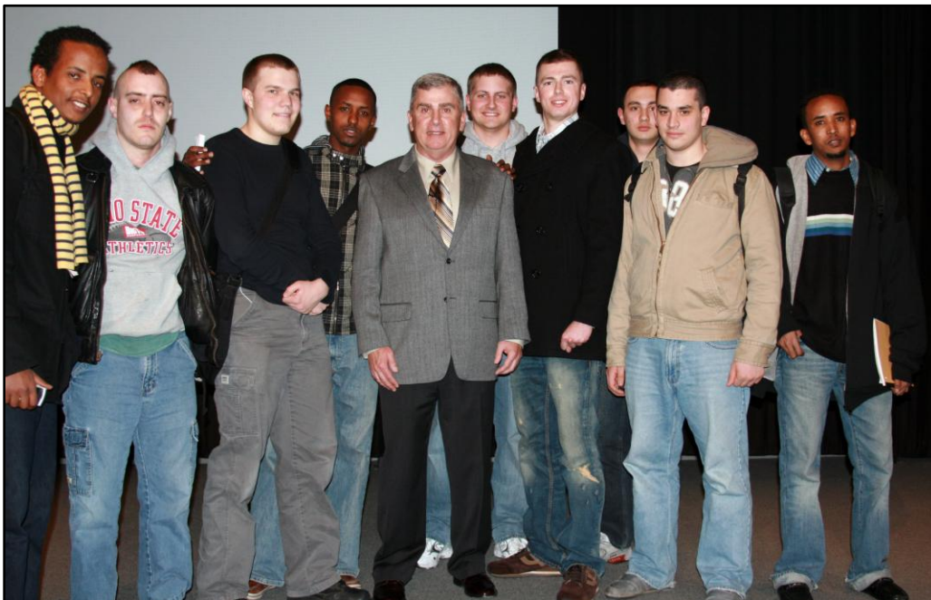
General John P. Abizaid stands with several students from The Ohio State University who attended his talk. The event drew more than 300 faculty and students, a large contingent of which have served or will serve with the Army, Navy, Air Force and Marines. The audience also included a number of students from Somalia.