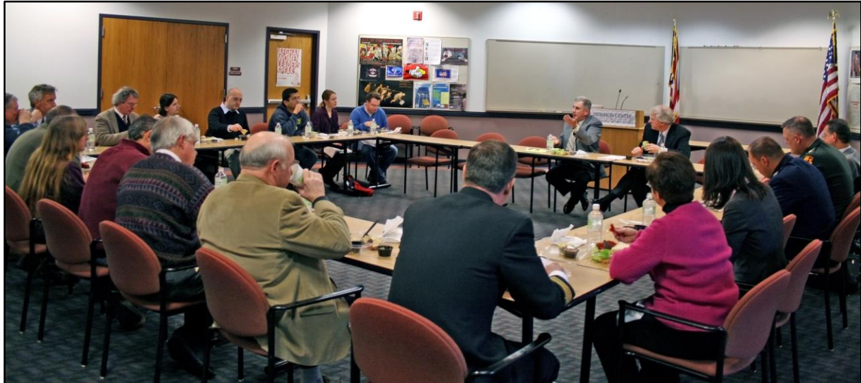
General John P. Abizaid (front left), former Commander of U.S. Central Command, meets over lunch with Mershon faculty and graduate students on February 20, 2008, at the Mershon Center for International Security Studies.