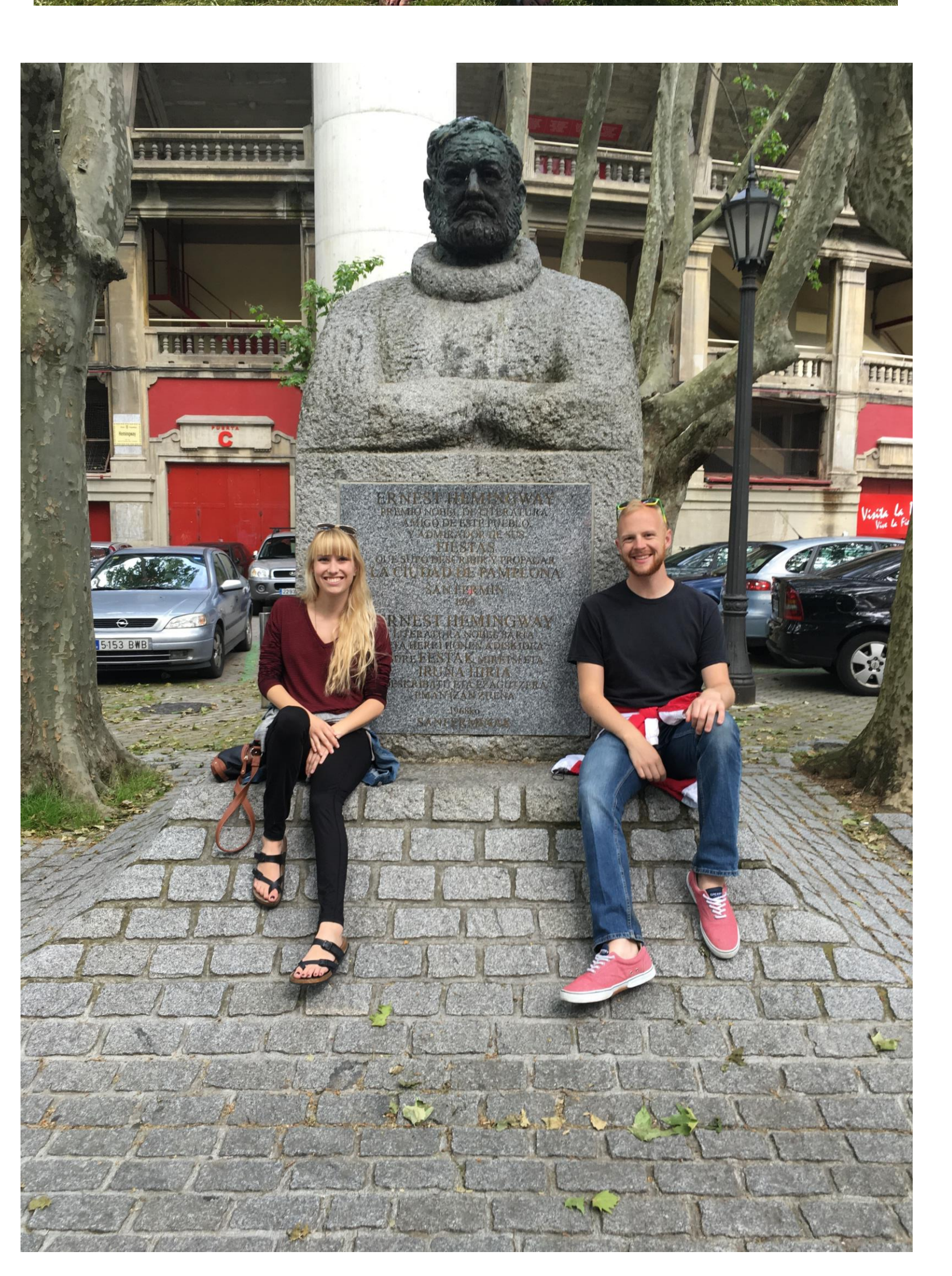
Memorial to Ernest Hemingway outside of Pamplona's Plaza de Toros, the bull fighting stadium.