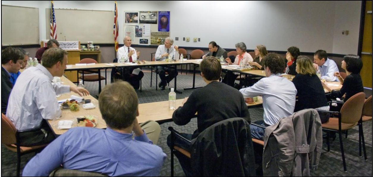
Joseph Nye speaks with Mershon affiliated faculty members during a lunch after his lecture on February 11, 2009, at the Mershon Center.