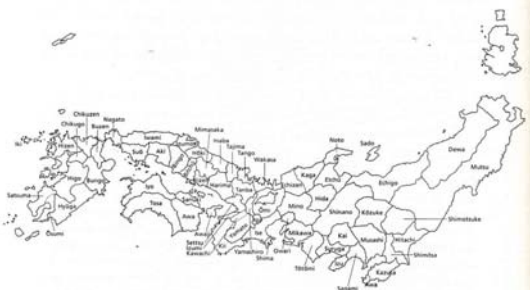
Figure 9. Outline of the Kyōhō map of Japan made by the Tokugawa shogunate.