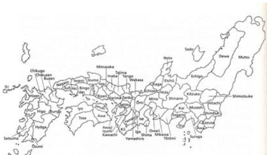
Figure 8. Outline map of Nagakubo Sekisui's Kaisei Nihon yochi rōtei zenzu .