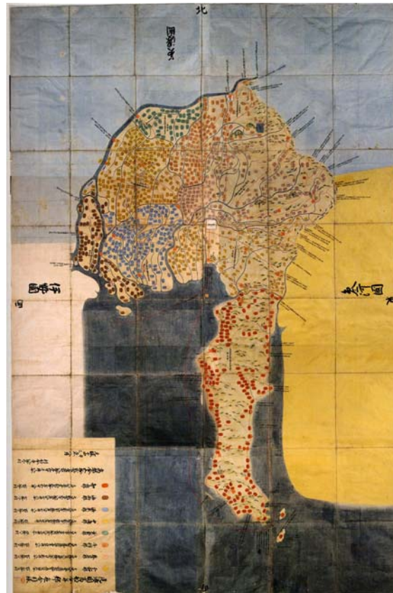
Figure 4. “Genroku jū-nen Ōwari kuniezu,” reproduced in Kuniezu no sekai , op. cit., p. 61, plate 3.

proval. Banning the use of the terms was intended to compel daimyo and other local officials to settle disputes over land and territory locally, and not simply pass them up the ladder to higher authorities. It is tempting to interpret the erasure of