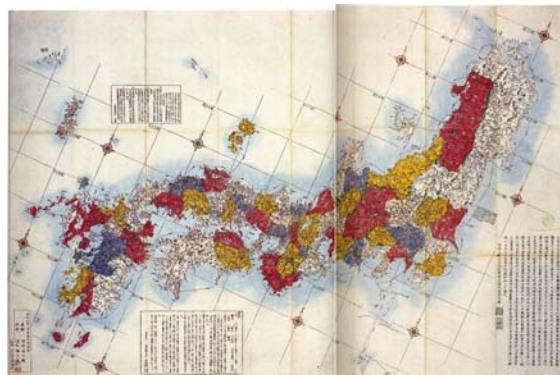
Figure 9. Nagakubo Sekisui, "Kaisei Nihon yochi rotei zenzu 改正日本輿地路程全図," Bunka 文化 8 (1811), reproduced in Yamashita Kazumasa 山下和正, Japanese Maps of the Edo Period 地図で読む江戸時代 (Tokyo: Aki Shobō, 1998), pp. 50-51, plate 1.