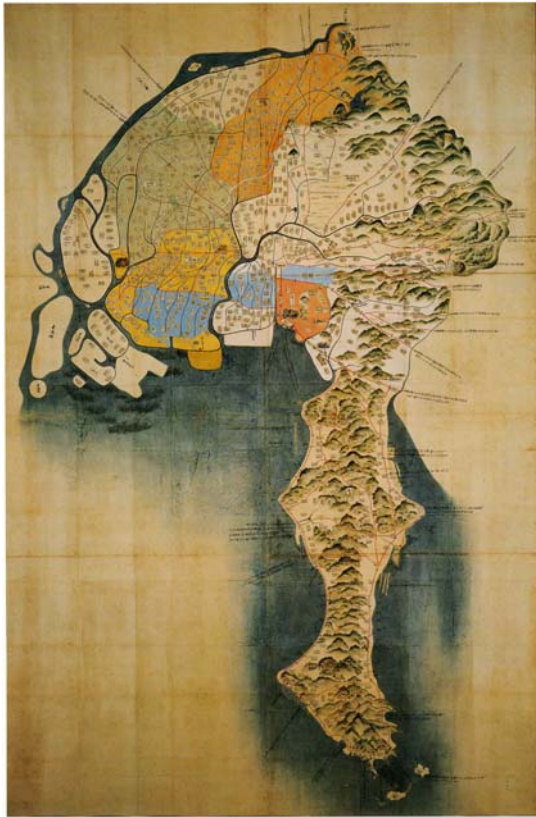
Figure 3. “Shōhō yon-nen Ōwari kuniezu,” reproduced in Kuniezu no sekai , op. cit., p. 60, plate 2.

each village ( muradaka 村高) is not precisely recorded. 11 In the case of the Shōhō-era Ōwari map, the Bakufu’s established standards of cartographic representation were all but ignored at the province level, but in the Genroku-era map, all these discrepancies were rectified and the kuniezu conformed completely to Bakufu standards (Figure 4).