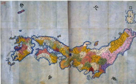
Figure 10. “Kyōhō Nihonzu 享保日本図,” reproduced in Kuniezu no sekai , op. cit., pp. 22-23, plate 5.