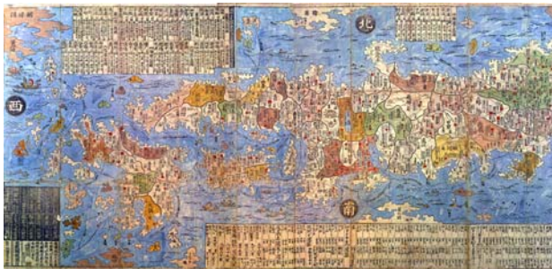
Figure 6. Ishikawa Ryūsen, “Honchō zukan kōmoku 本朝図鑑綱目,” reproduced in ibid. , plate 30.

dieval lore (the “no-man’s-land” called “Gandō” 廣道 or “Kari no michi” to the north, and “Rasetsu-koku 羅刹国,” the “island of women” to the south) that never appear on Bakufu maps. Other maps show still other visions of Japan: as Toby notes, the Shinsen Dai Nihon zuran 新選大日本図覽 (author unknown, Enpō 延宝 6 [1678], collection of the Kobe City Museum) resembles Ishikawa Ryūsen’s map, yet does not show mythical lands and more consistently depicts the borderland regions of Ezo and Ryūkyū as distinct from the rest of the archipelago, not as an integral part of a visually unified whole. 29