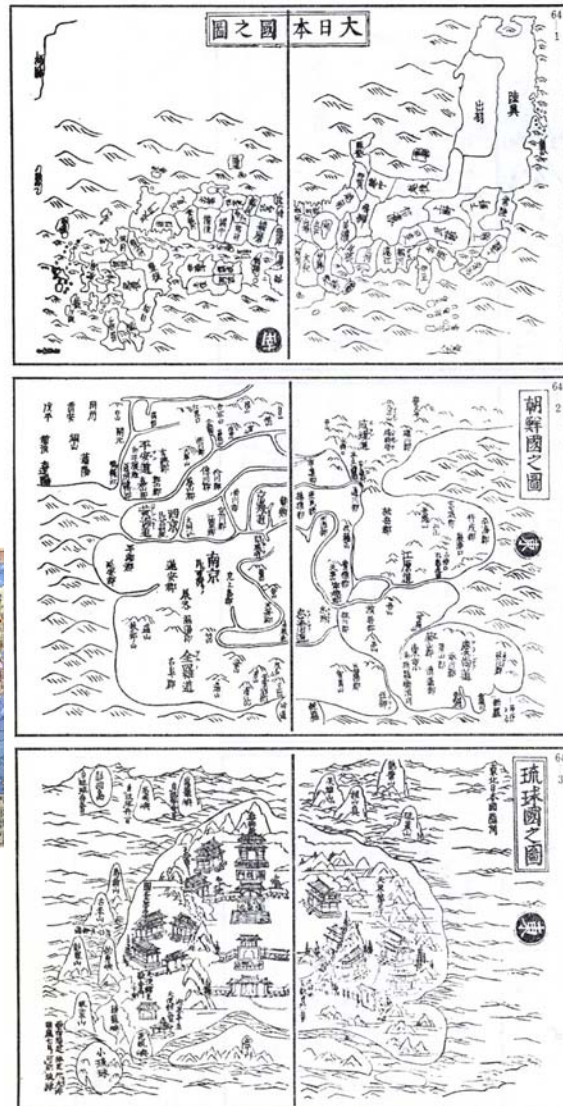
Figure 7. Maps from Wakan sansai zue are reproduced in Wakan sansai zue (I), in Nihon shōmin seikatsu shiryō shūsei 日本庶民資料集成, Vol. 28, edited by Tanikawa Ken’ichi 谷川健一 (Tokyo: San’ichi Shobō, 1980), pp. 917-918.

Shinsen Dai Nihon zuran as being more “advanced” ( susunde iru ) (p. 90) than the maps of Ishikawa Ryūsen or other contemporary mapmakers, a description that seems at odds with his otherwise anti-teleological argument.