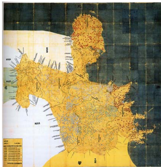
Figure 2. "Genroku Bungo kuniezu," reproduced in Kuniezu no sekai , op. cit., p. 285, plate 5.