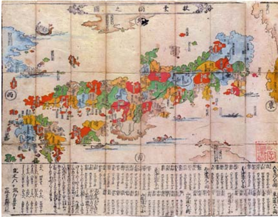
Figure 5. “Fusōkoku no zu,” reproduced in Akioka Takejirō, ed., Nihon kochizu shūsei: Nihon zenzu 日本古地図集成：日本全図 (Tokyo: Kajima Shuppankai, 1971), plate 24.