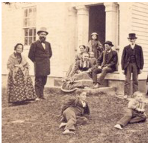
This 7" x 4" (18.8 x 10 cm) stereoscope card was produced around the time of the opening of the James A. Garfield Monument at Lake View Cemetery in Cleveland. This image was taken in 1875 in front of the Rudolph home in Hiram, Ohio.