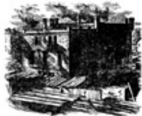
VIEW OF THE ACT AT CANTON, OHIO, WHEN THE FUGITIVE WAS OFFERED.