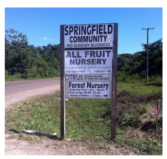
Figure 3: Sign Indicating the Location of the Springfield Settlement along the Hummingbird Highway

Springfield Mennonites constructed a market building in the center of their settlement near the sawmill and the meetinghouse. On the bi-weekly market days, this usually isolated settlement bustles with activity. Vans and pick-ups drive in and out while the Springfield Mennonites are busy packing and selling products. The three "market workers" coordinate the selling of vegetables and farming products to wholesale buyers from outside the settlement. At the turn to Springfield on the Hummingbird Highway, an eye-catching billboard advertises their range of trees for sale (Figure 3). At the Belizean market, these fruit trees are known for their high quality and are therefore much in demand.