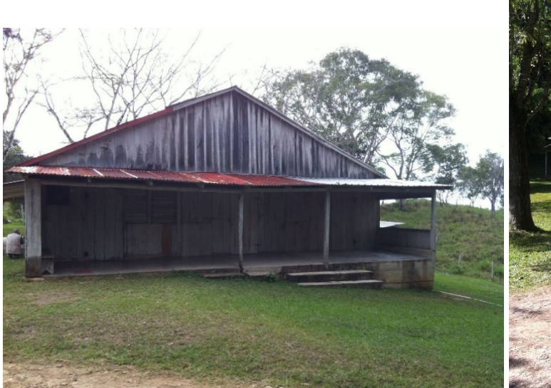
Figure 2: Upper Barton Creek (Left) and Springfield (Right) Meetinghouses