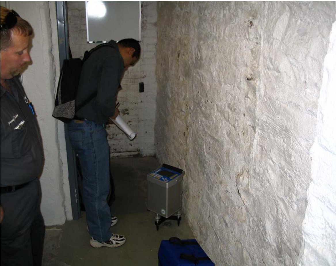
Figure 3. Gravimeter reading at the old COSI basement.

This site is located in the basement of the old COSI building in downtown Columbus. The exact address is 280 East Broad Street. Upon arrival at the site the marker was hidden under a thick layer of basement floor paint. We cleaned the marker using a steel brush. The marker was placed by NOAA/NGS in 1987. The site used to be directly underneath a giant pendulum that was used to determine its absolute gravity. The latitude and longitude of this point are N 39 ° 57' 49.78'' and W 82 ° 59' 35.14''.