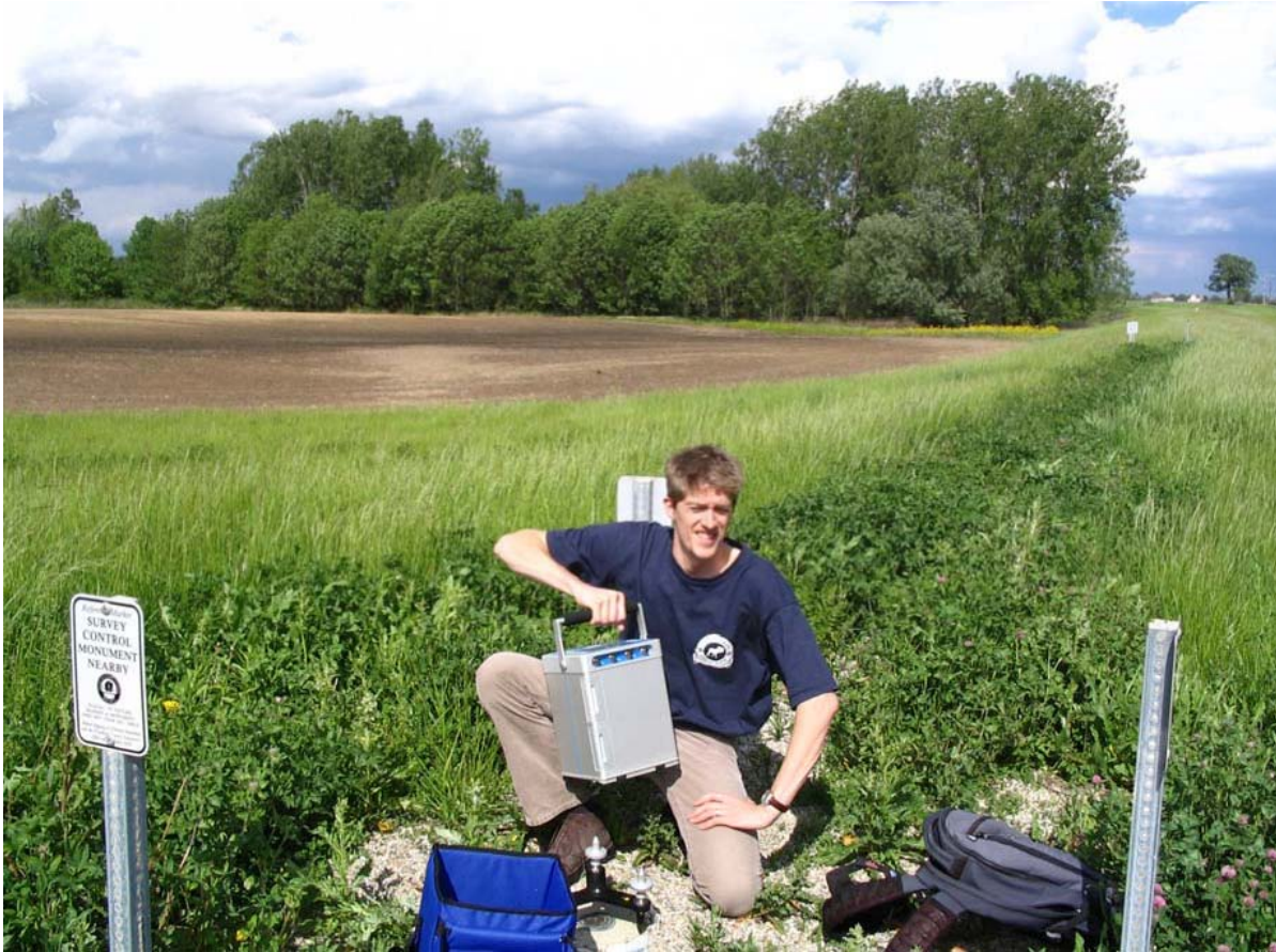
Figure 4. Gravimeter being setup for reading at an absolute gravity measurement site near Bolton Airfield.

The site is located southwest of Columbus near the Bolton Airfield close to the corner of Norton road and Johnson road. The site is 1 meter above the road and situated on top of a small flood retain wall. It is in the center of three plastic tubes sticking out of the ground. There are a series of geodetic markers running east from there. The latitude and longitude of this point are N 39° 53' 29.7" and W 83° 09' 16.2".