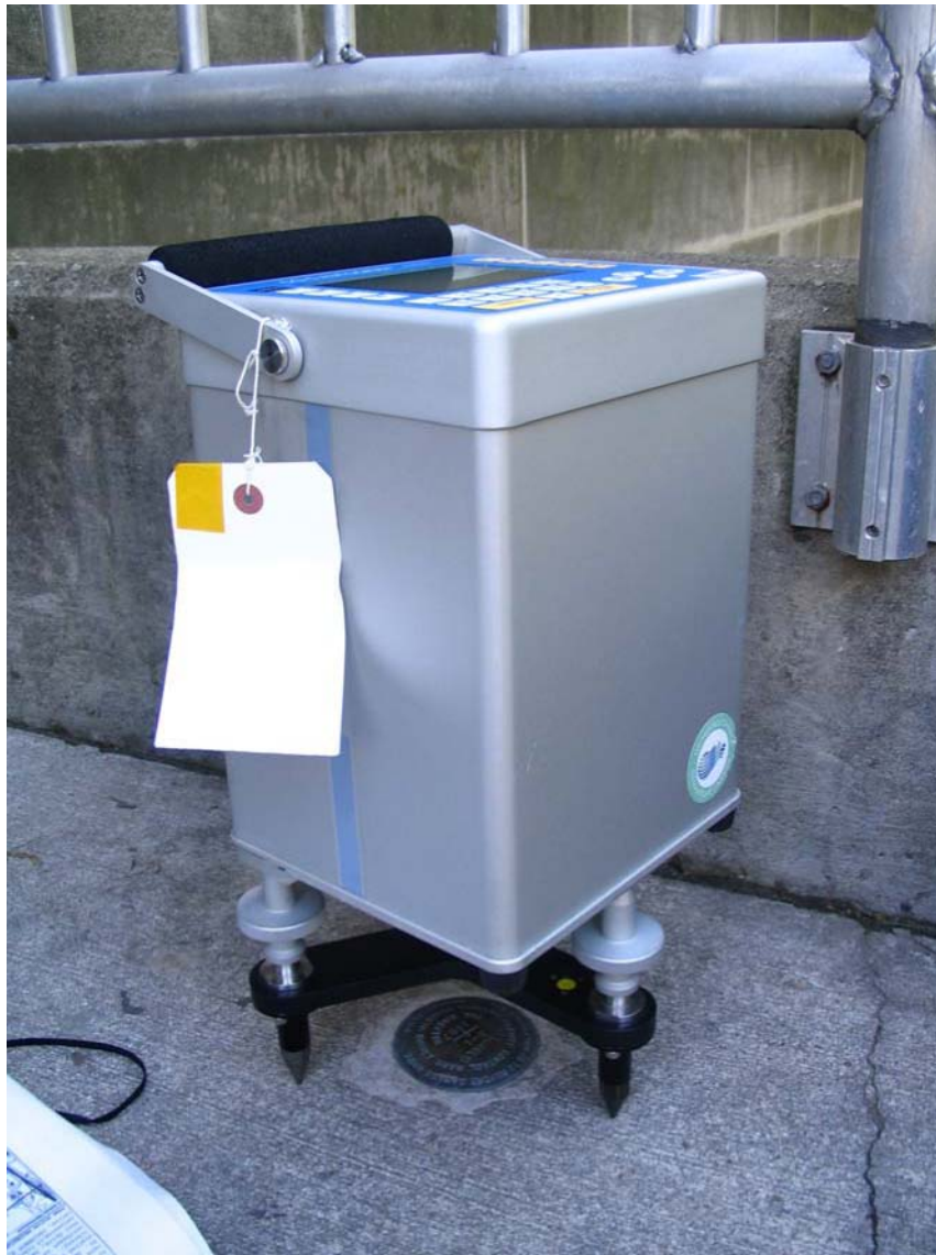
Figure 2. Gravimeter at the OSU Main Library.

This site is located just north of the Ohio State University William Oxley Thompson Memorial Library (Main Library on the Oval) on the stairwell leading to the main northern entrance, about 1 m from the wall of the library itself. Close by is a geographic marker indicating 40°N latitude. The actual site is marked with a copper plate placed by NOAA/NGS in 1987. The latitude and longitude of this point are N 39° 59' 58.3" and W 83° 00' 52.9" as measured with a simple handheld GPS device. The site might be destroyed in the near future due to library renovations.