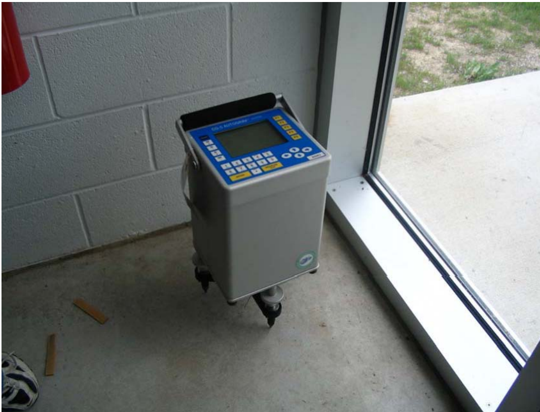
Figure 1. Base station at the U.S. Polar Rock Repository, BPRC.

We set up our base station in the northeast corner of the U.S. Polar Rock Repository next to the Byrd Polar Research Center. This site was chosen because it is least likely to experience any disturbances that occur in the Byrd Center itself due to various activities. The site is marked with a black cross on the ground. It is about 20 cm from the north wall and 20 cm from the east wall/window. Measurements at the base station were done before and after all tie points were visited.