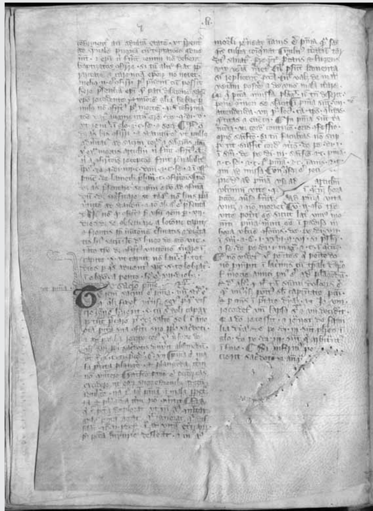
Figure 6.2. Rare Books & Manuscripts Library of the Ohio State University Libraries. MS.Lat.1, fol. 47v.

pered with rubricated characters that help punctuate the text and set off different sections of the treatise. These colored letters and symbols work alongside the thematic headings at the top of each leaf, the chapter summaries and short sectional titles written in the margins, and the topical index inserted at the beginning of the book to help readers better navigate the Oculus's complex text.