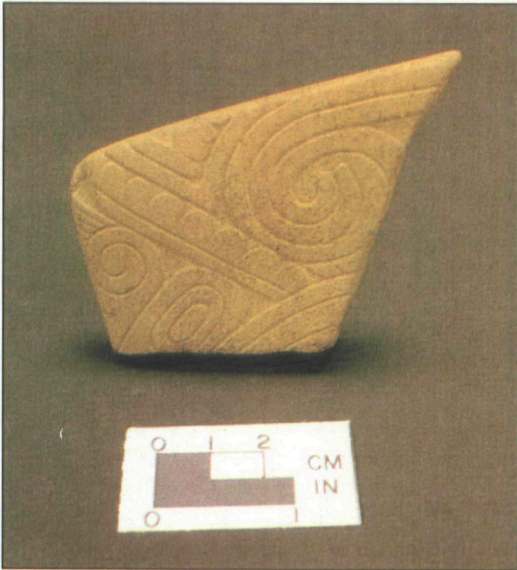
Figure 2. Rinehart Tablet. Accession # 203/189.