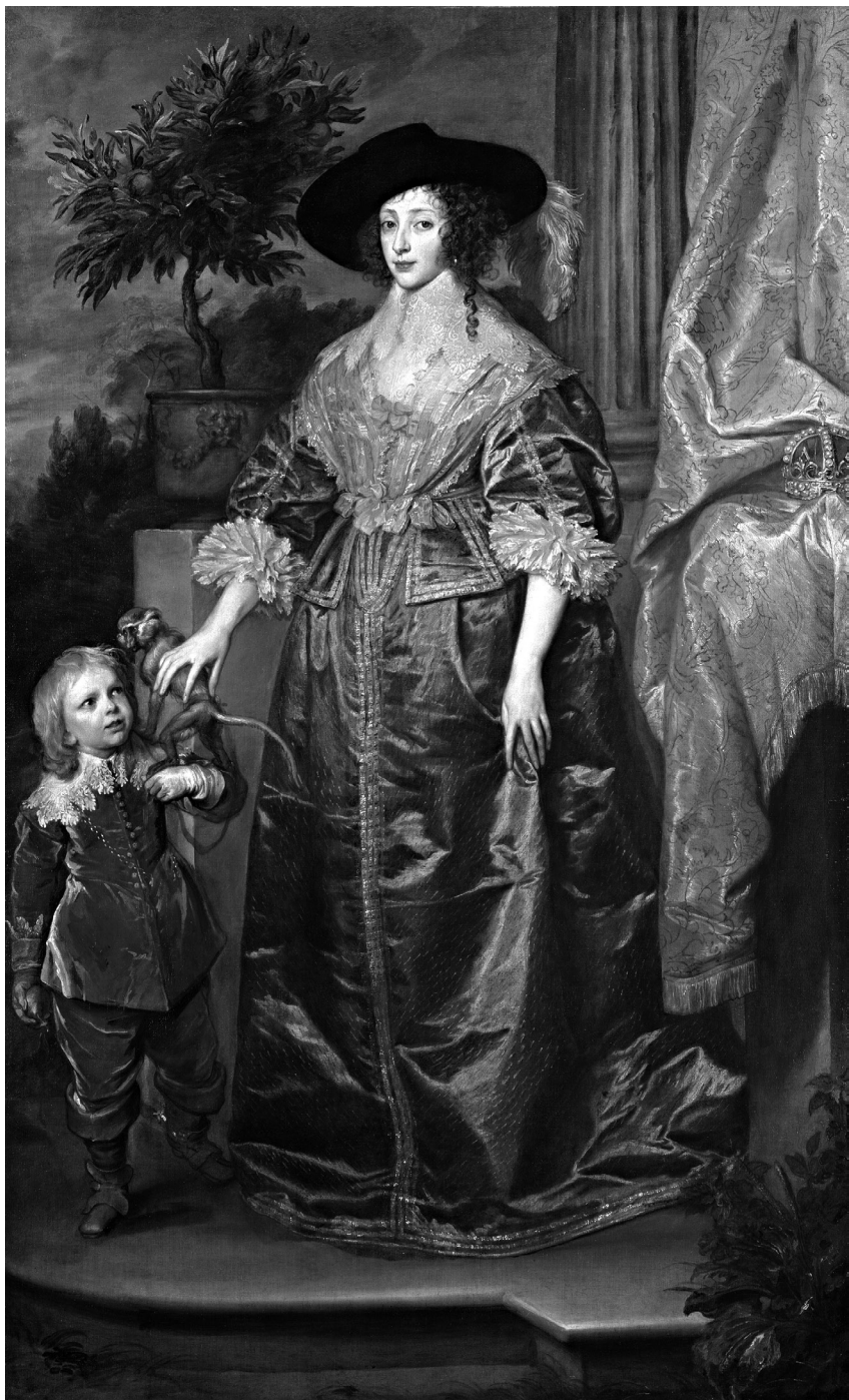
Figure 2. Sir Anthony van Dyck, Queen Henrietta Maria with Sir Jeffrey Hudson, 1633, Samuel H. Kress Collection.