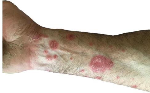
Figure 1. Psoriatic lesions on the inner surface of the forearm.

In experimental studies 15 patients (11 men and 4 women, 47 \pm 15 years, Orel Regional Dermatovenereological Dispensary, Orel, Russia) participated. All patients had a diagnosis of plaque psoriasis of the stationary stage. The study included patients who had plaques on the inner surface of the forearm (Figure 1).