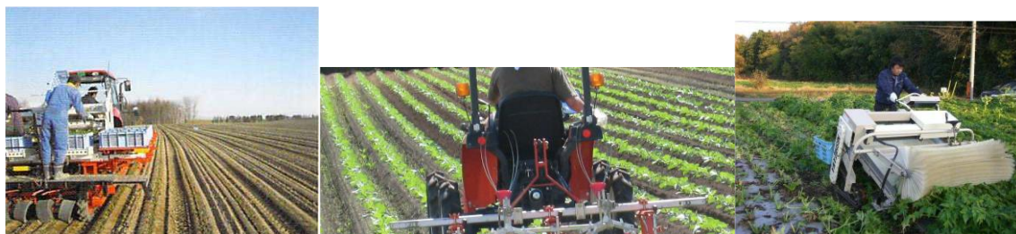
Figure 1. Some agrotechnical elements of angelica production (Hitachinaka, Japan)

Some agrotechnical elements are shown in Figure 1 .