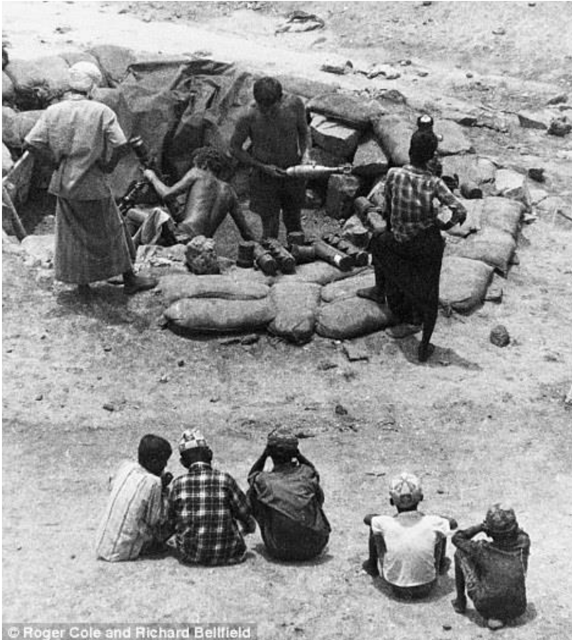
British 81mm Mortar at Mirbat.