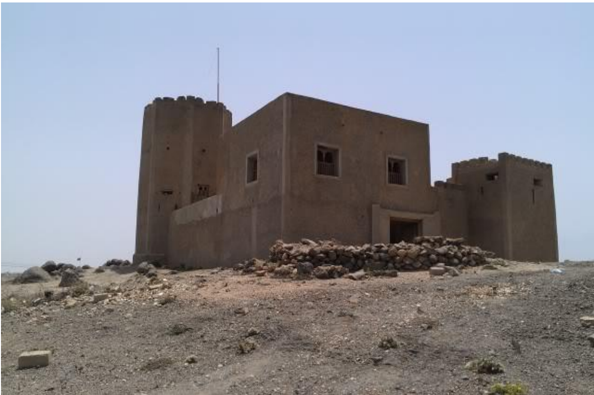
Mirbat Fort and the 25 pounder gun pit.