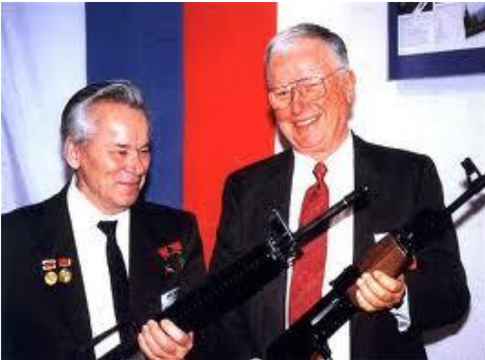
(L-R) Mikhail Timofeyevich Kalashnikov and Eugene Stoner. Eugene Stoner was the designer of the AR-15 (M16) rifle. Kalashnikov is holding the M16.

http://www.irintech.com/x1/co/2588/Mikhail-Timofeevich-Kalashnikov-meets-Eugene-Stoner