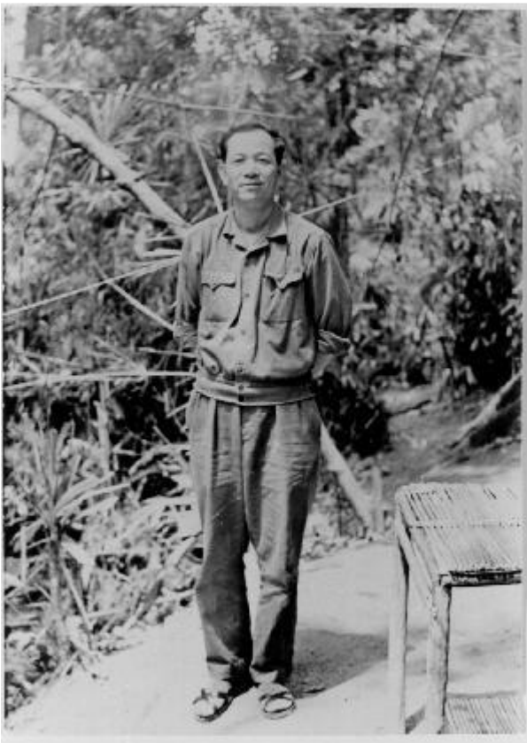
Nguyen Huu An

(5) The North Vietnamese commander on the battlefield, Nguyen Huu An, has a keen memory of that bloody afternoon of November 17, 1965, on the trail to landing Zone Albany: "My commanders and soldiers reported there was very vicious fighting. I can tell you frankly, your soldiers fought valiantly. They had no choice. You are dead or not. It was hand to hand fighting. Afterwards, when we policed the battlefield, when we picked up our wounded, the bodies of your men and our men were neck to neck, lying alongside each other. It was most fierce."