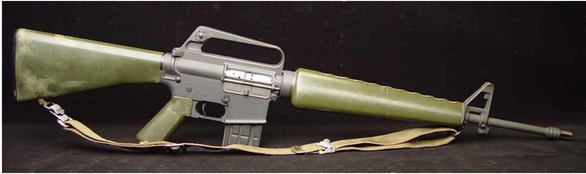
Early AR15 (M16)

The following six references have been extracted from: We Were Soldiers Once and Young by: Lt. Gen. Harold G. Moore (Ret.) and Joseph L. Galloway.