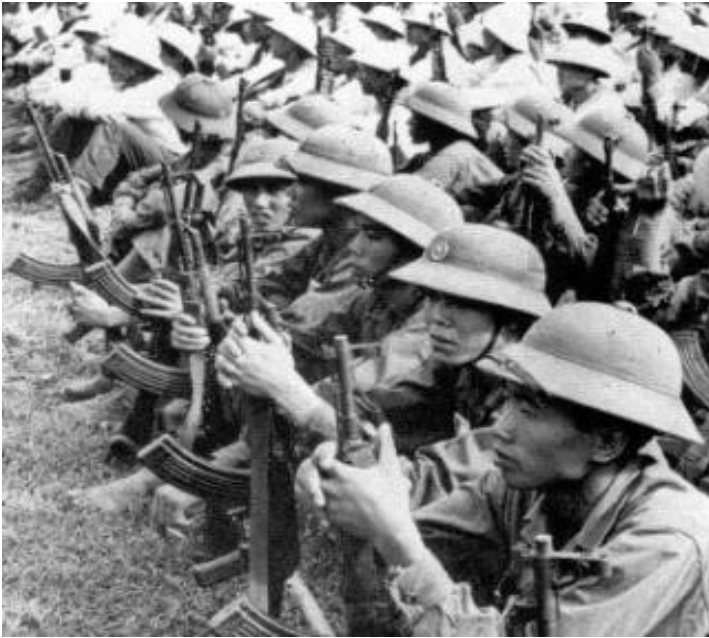
North Vietnamese troops with AK-47's.