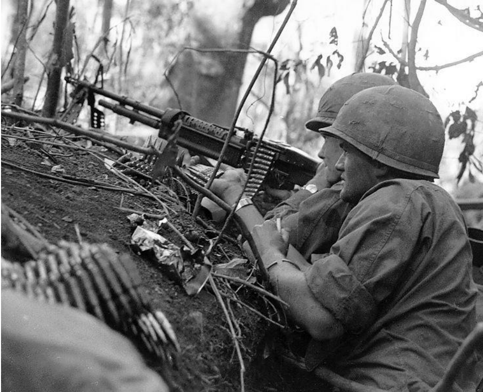
Above Photograph: M60 in action, Vietnam 1966