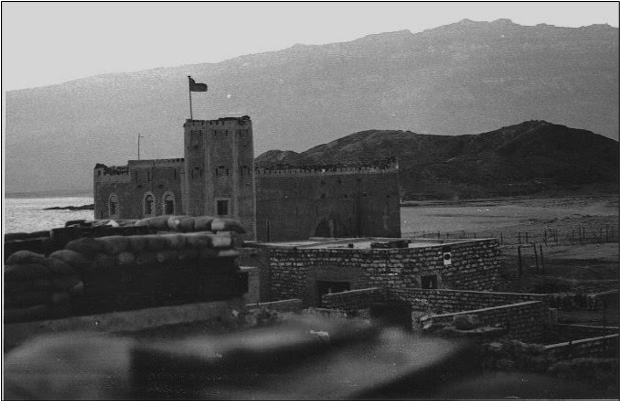
The Wali's Fort from the BATT House