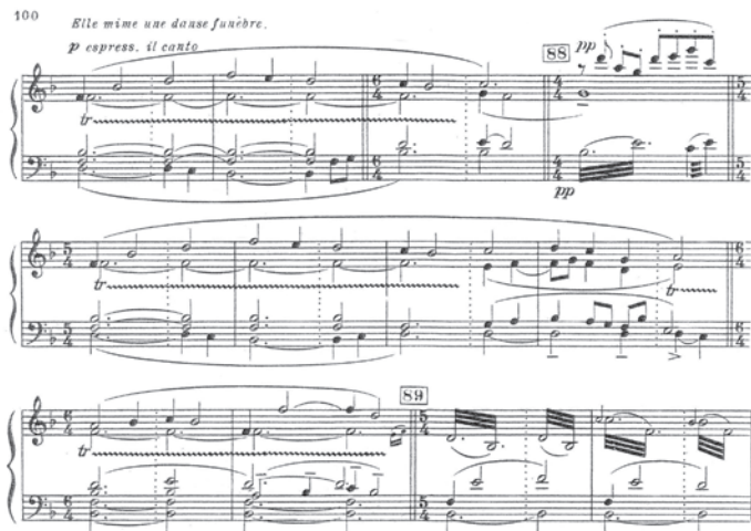
Example 4 Maurice Emmanuel, Salamine (1929), Act II, sc. 1 (VS 100).

expression seen in the placement of one hand on the head and the other directed toward the dead body. In Emmanuel’s Figure 543 one can see the earlier depictions of the ritual, which were later replaced by the stylized gesture in Figures 551 and 553 (See FIGURE 1a and 1b). Emmanuel described these latter poses as “prototypical” funeral gestures, and stated that although the ritual of tearing the hair had been lost, the gesture had been retained; moreover, Emmanuel described the dance for these funeral rites as “full of calm” versus the violence of the threnodic hair pulling. 10