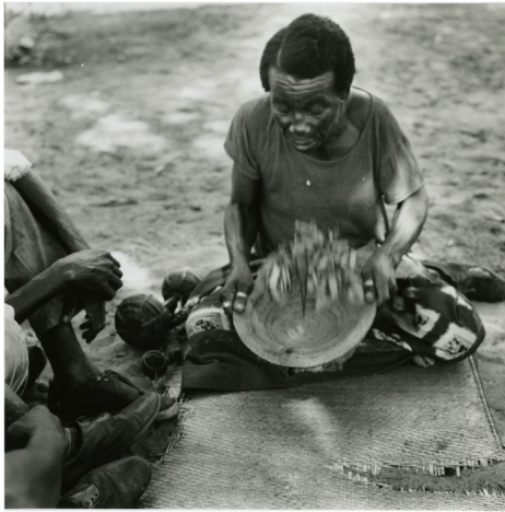
FIG 3 A basket diviner tossing his divinator pieces. Dundo, Angola, 1971.