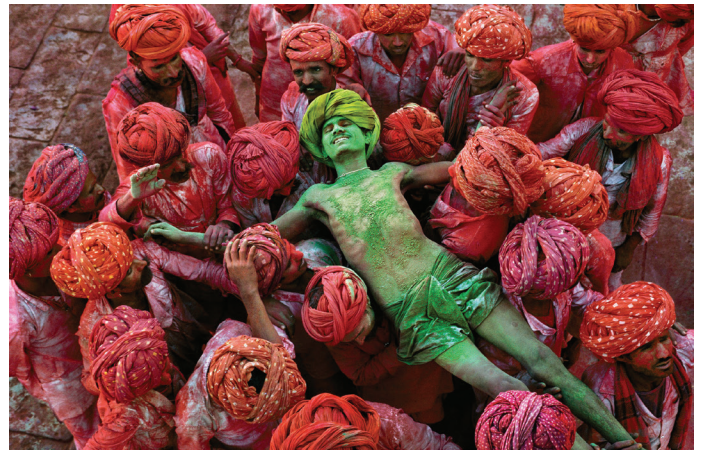
FIG. 2. Steve McCurry, Holi Man

relationship with South Asia, in particular India, a country he has visited over eighty times. As a photographer for National Geographic , and someone who frequently chooses India as the subject of his work, McCurry has found himself placed between two narratives rich with photographic history: that of India and National Geographic . What makes Steve McCurry's work in India iconic is his ability to transcend early twentieth-century colonial attitudes and to circumvent National Geographic's history of exploiting non-Western countries as an exotic other. In doing so, McCurry seeks to find commonality in the human condition and focus on the complex story the photographs possess.