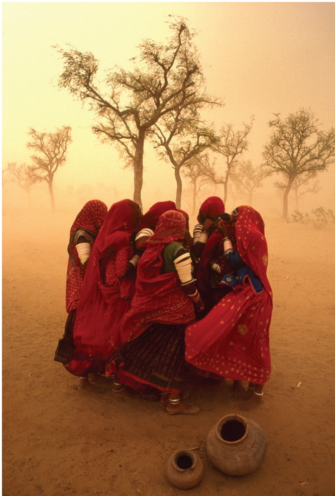
FIG. 1. Steve McCurry, Dust Storm

McCurry's distinct progression in the ranks of international photojournalism has influenced his personal photographic approach, one that seeks to frame the human condition in the far corners of the world. He has also created an extensive