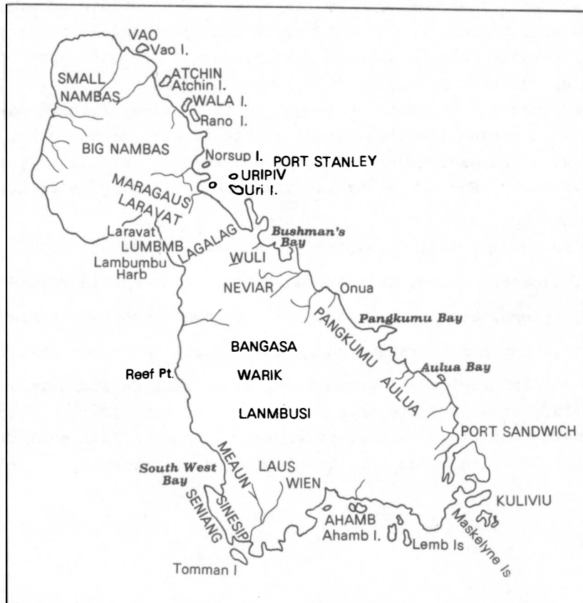
LANGUAGE MAP OF MALEKULA