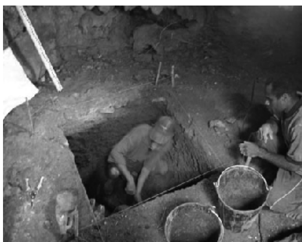
Figure 2 Baiva Ivuyo collects soil for processing in excavations at Lachitu Cave