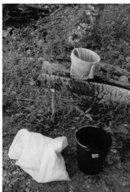
Figure 5 Basic flotation equipment: flotation sieve (upper right) on sago leaf drain, woven plastic sample sack (lower left) & plastic bucket (lower right)