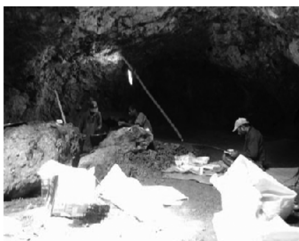
Figure 3 Sample sacks (in foreground) being filled after weighing at Lachitu, Cave