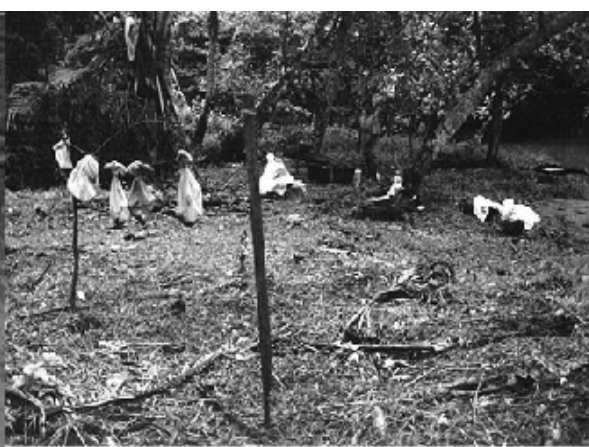
Figure 11 Flotation sieves drying in the sun