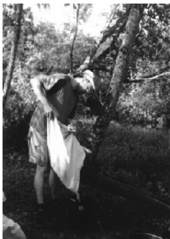
Figure 6 Andy Fairbairn pours the sample into the bucket