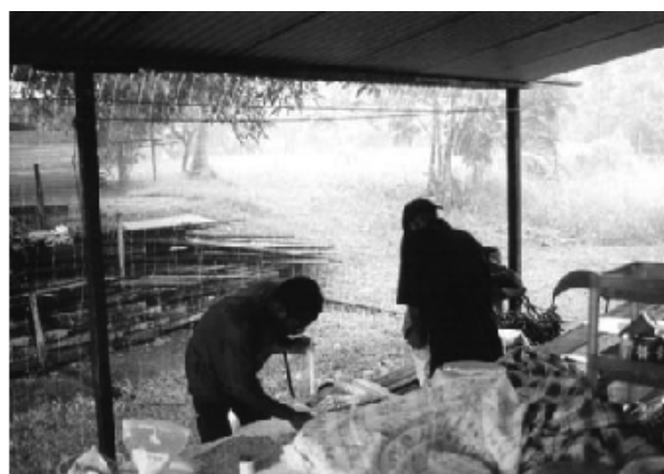
Figure 17 A sudden rainstorm