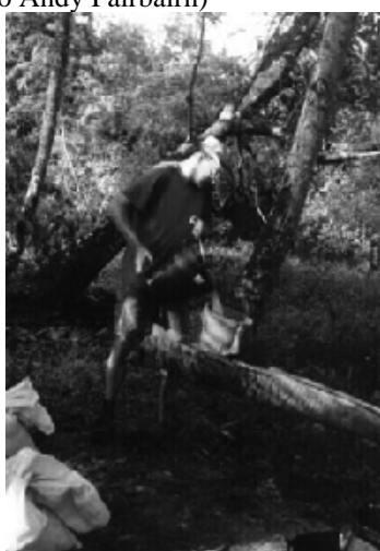
Figure 8 Pouring the water and floating plant material through the flotation sieve