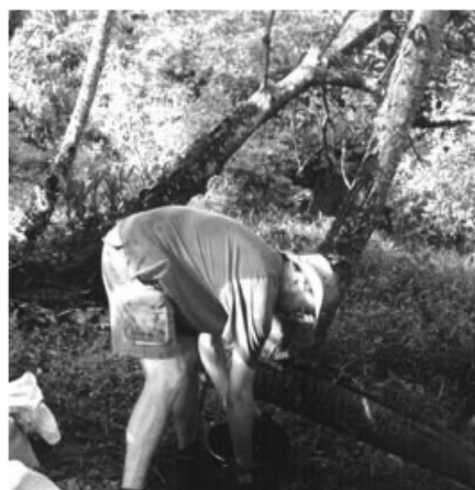
Figure 7 Stirring up the sample after adding water