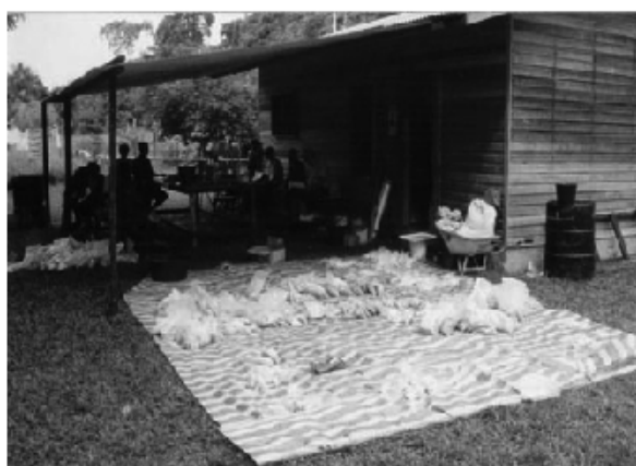
Figure 15 Fully processed samples lined up before preparing inventory and packing them for shipment