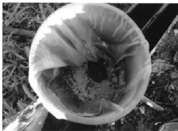
Figure 9 The flotation sieve with a small amount of charred plant material from the lower levels of Taora