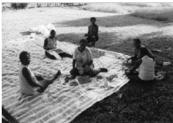
Figure 12 Sorting and drying heavy residues