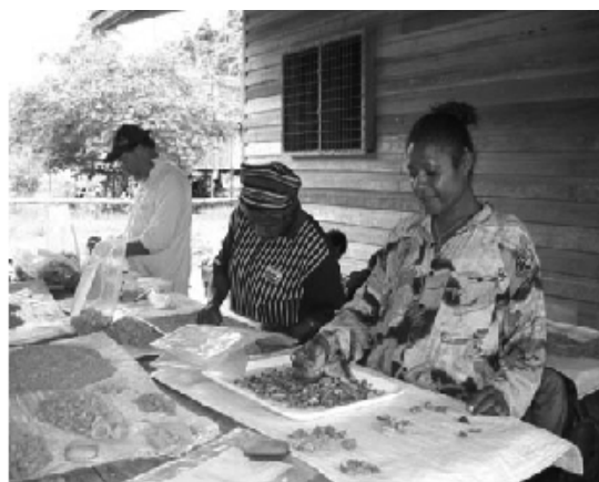
Figure 13 Sorting heavy residues