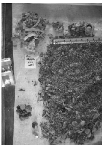
Figure 14 A partially sorted heavy residue with shells, bones and discard in piles