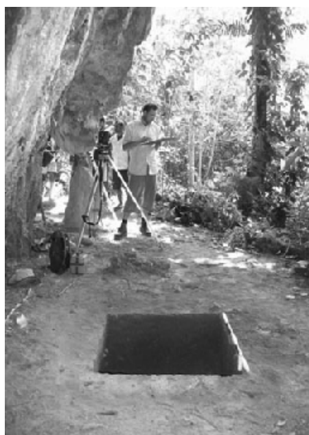
Figure 4 Andy Fairbairn recording on one of the many forms during excavation