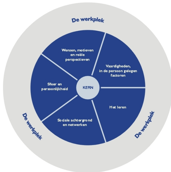
Employee flywheel 3